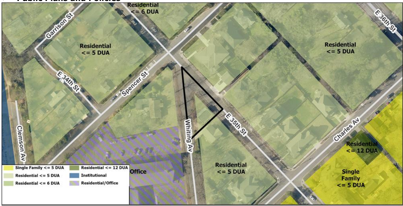
The 36th Street Transit Station Area Plan recommends residential uses up to five dwelling units per acre for the site.