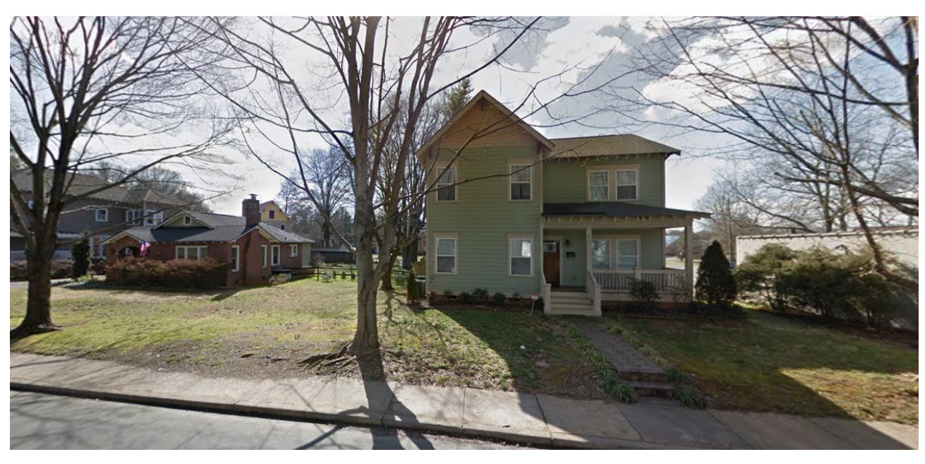
The rezoning site abuts a single family residential home.