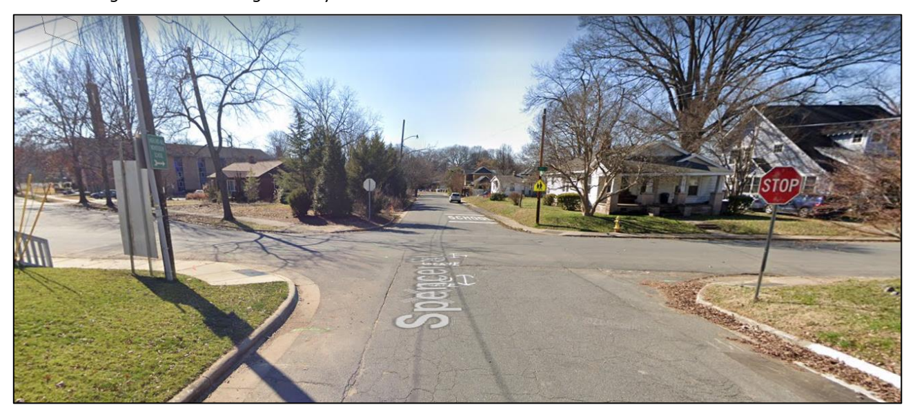
The rezoning site is immediately surrounded by residential and institutional uses.