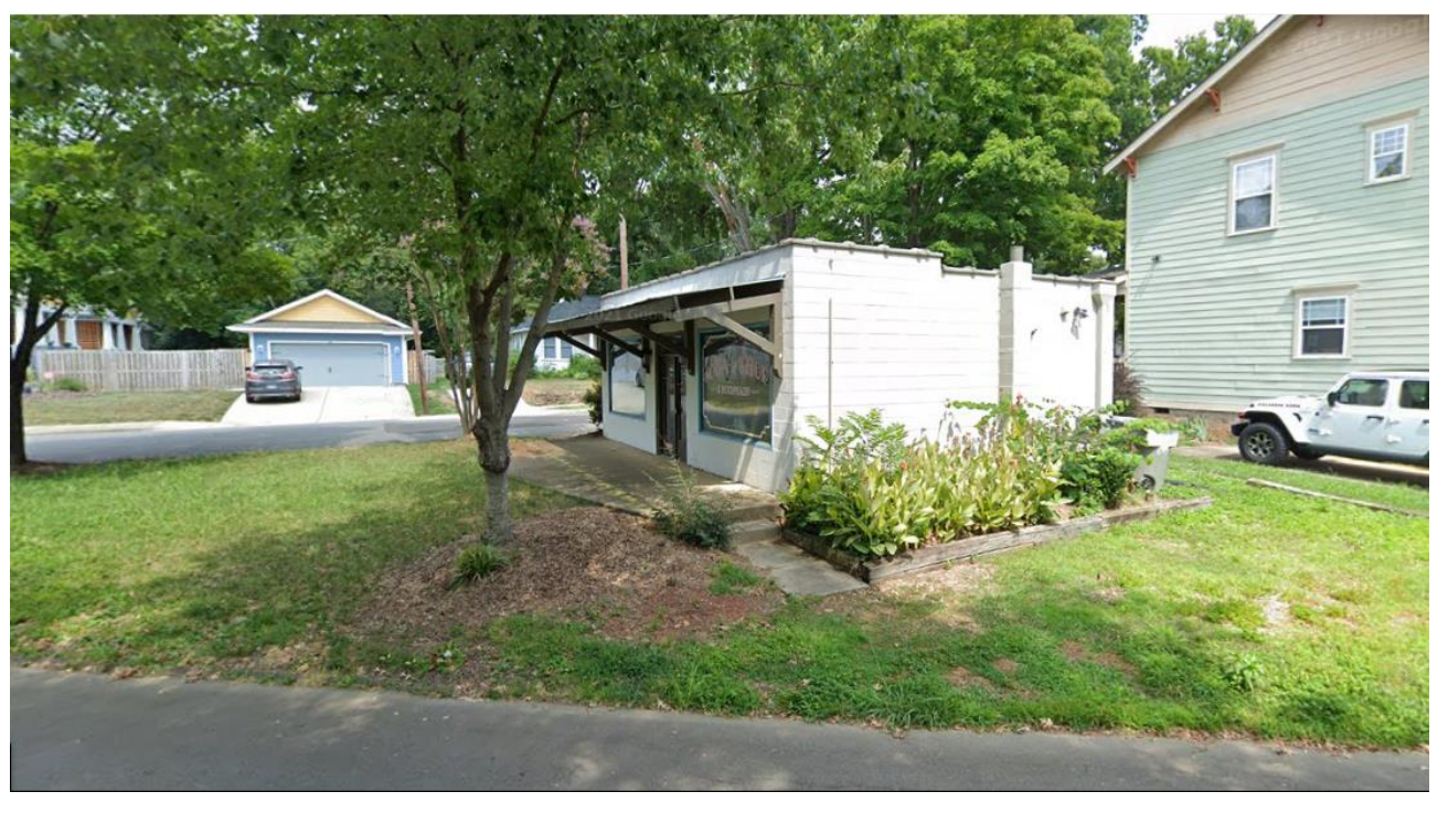
The site is developed with a 1-story commercial building constructed in 1945.