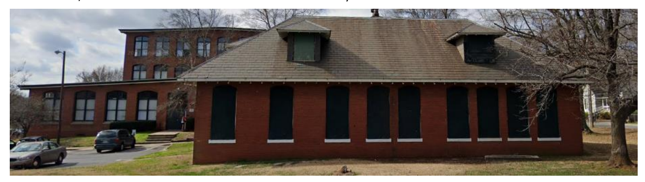
View of the subject property in the foreground with Hoskins Mill in the background.