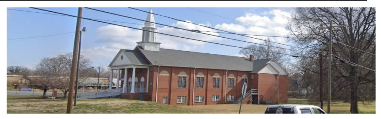
The property to the east of the site across Gossett Avenue is developed for institutional use.

Petition 2021-036 (Page 4 of 7) Final Staff Analysis