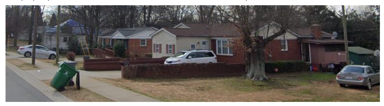
The properties to the south of the site along Gossett Avenue are developed with single family residential uses.