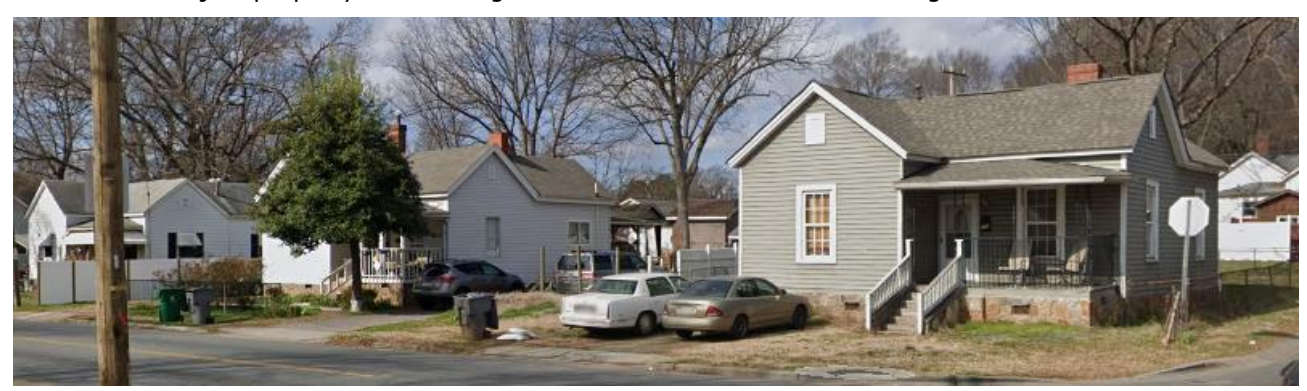
There properties to the north of the site across Hoskins Road are developed with single family residential uses.