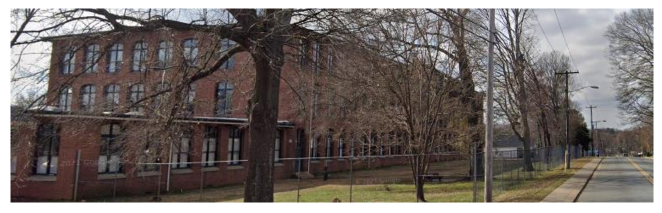
The property to the west of the site is developed with Hoskins Mill, a former industrial building that has been converted to multifamily residential units.