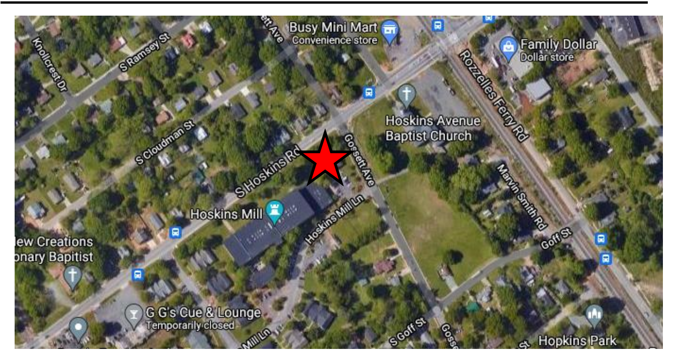
The site is adjacent to Hoskins Mill, which houses multifamily units, and is surrounded by single family, commercial, and institutional uses. The site is marked by a red star.

Petition 2021-036 (Page 3 of 7) Final Staff Analysis