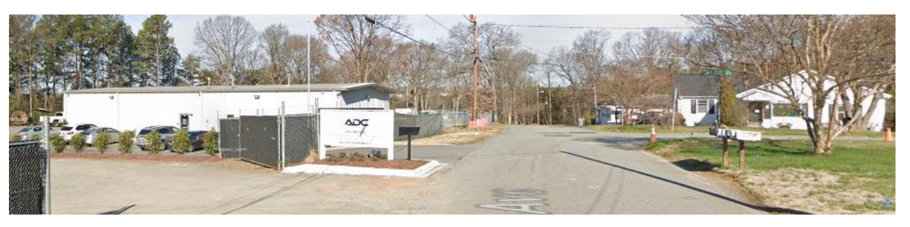
The properties to the north are developed with industrial and single family residential uses.