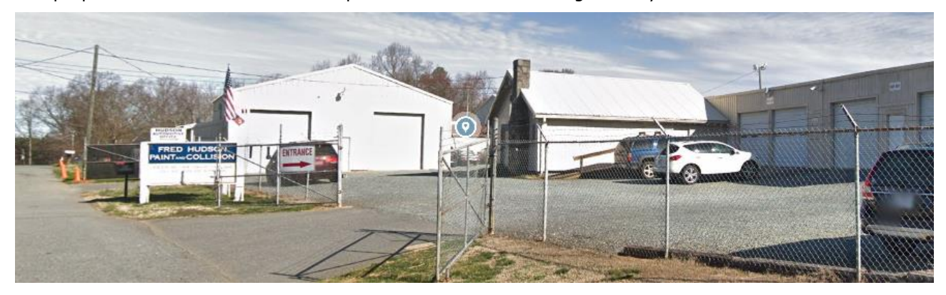
The properties to the east of the site across Jason Avenue are developed with industrial and commercial uses.