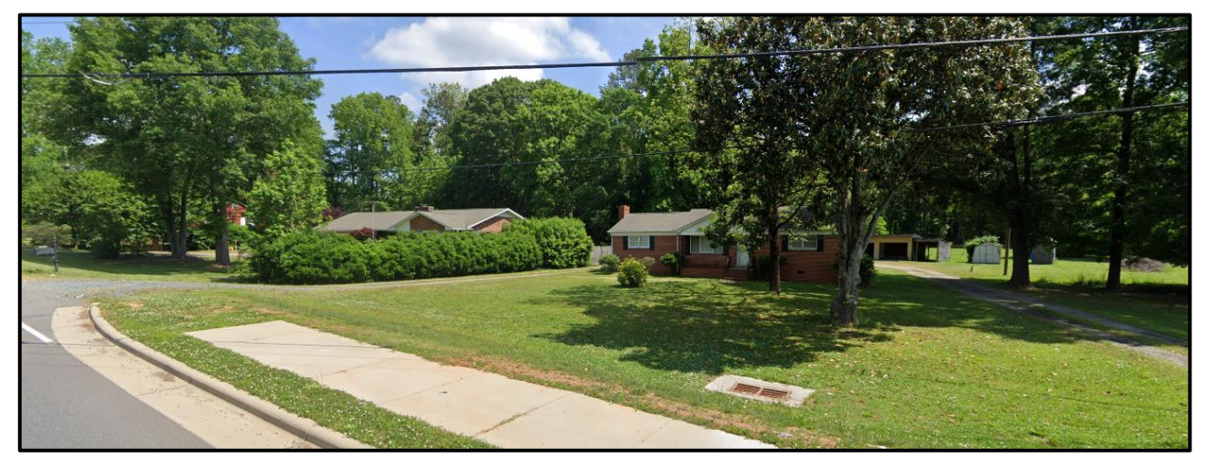
The property to the southwest along Oakdale Road is developed with single family homes.