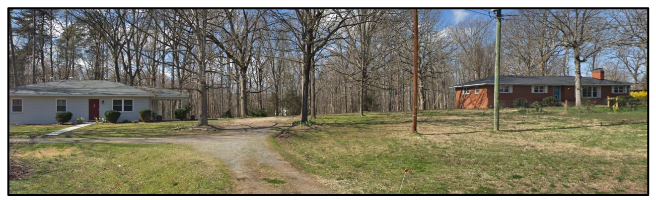
The property to the northeast along Mt. Holly-Huntersville Road is developed with single family homes.