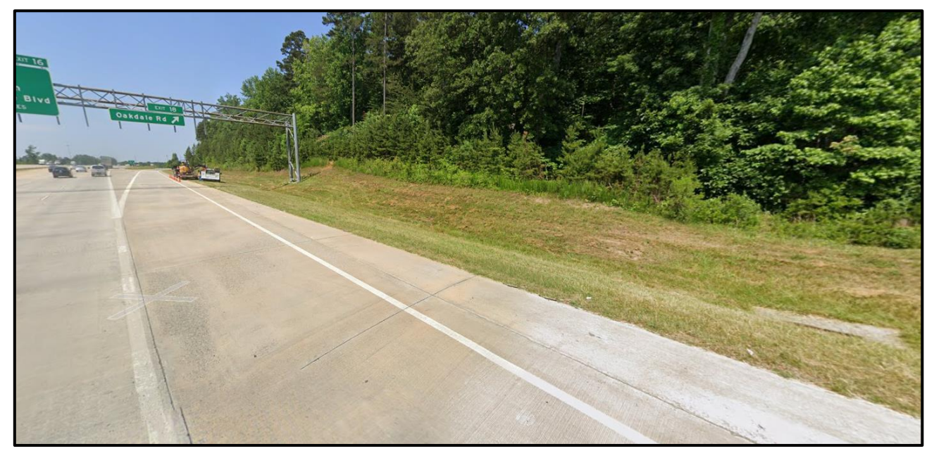
The property is bordered by Interstate 485 to the south.