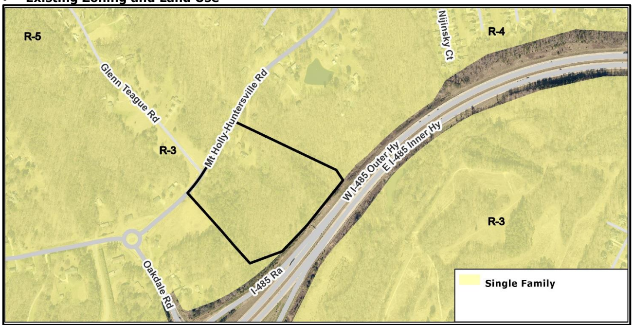
The surrounding land uses are single family uses.