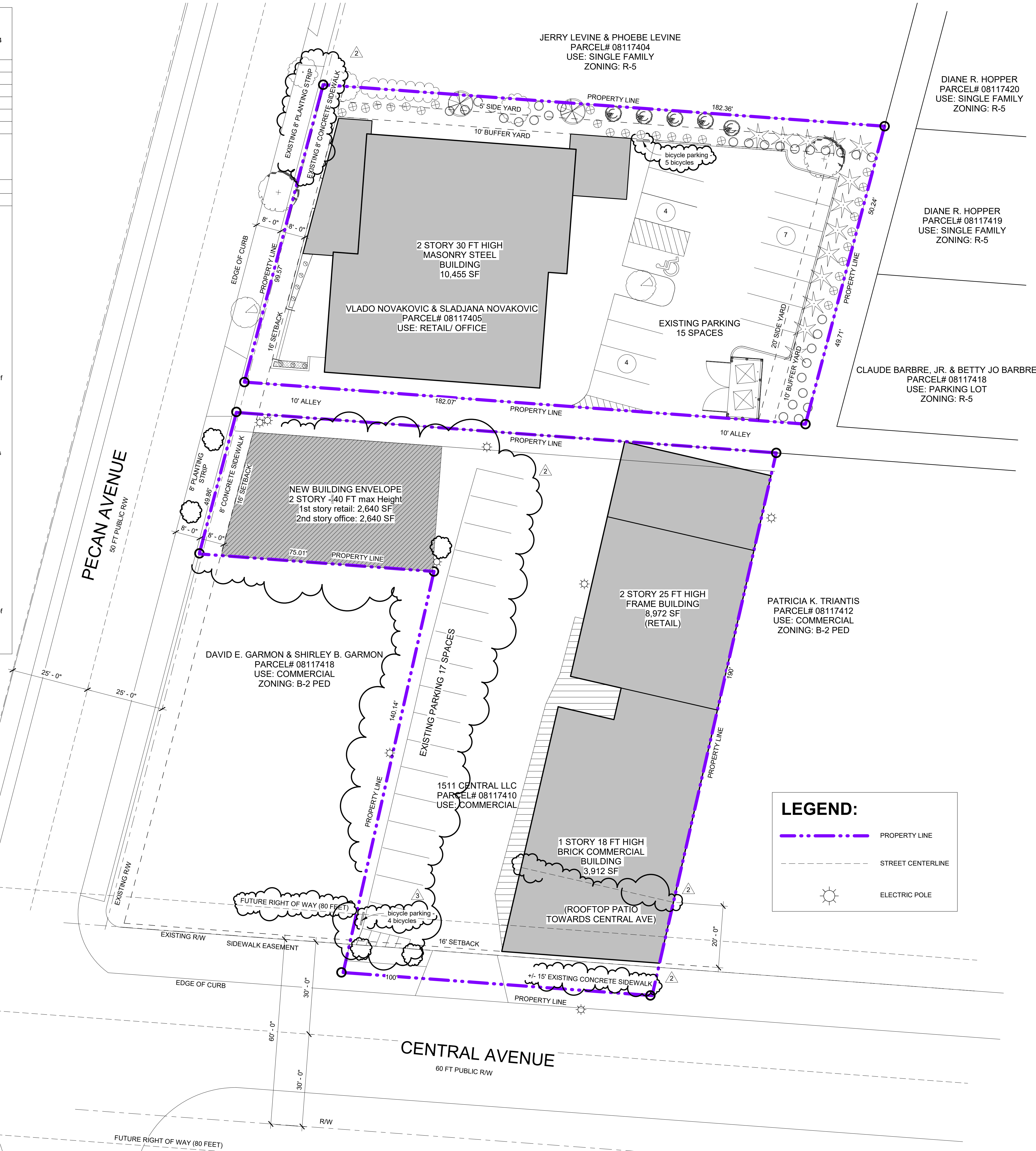
1 REZONING PLAN 1/16" = 1'-0"