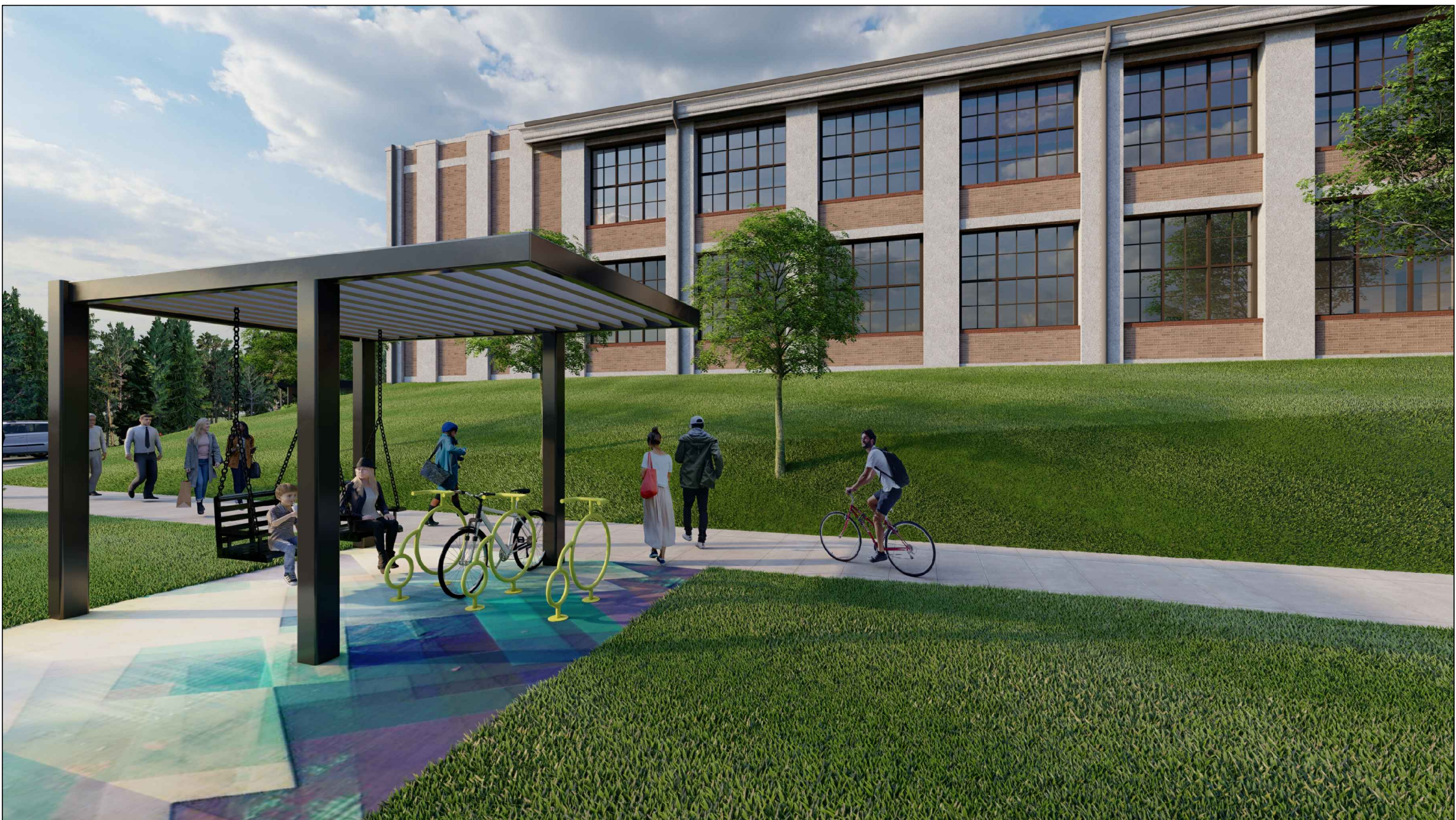
PUBLIC AMENITY RENDERING