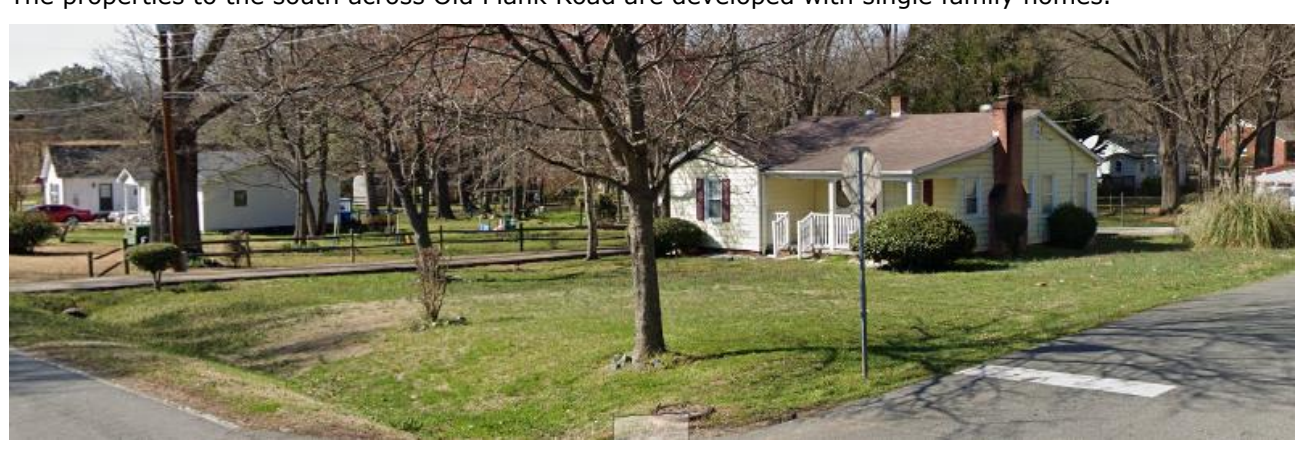
The properties to the west along Old Plank Road and Chapman Street are developed with single family homes.