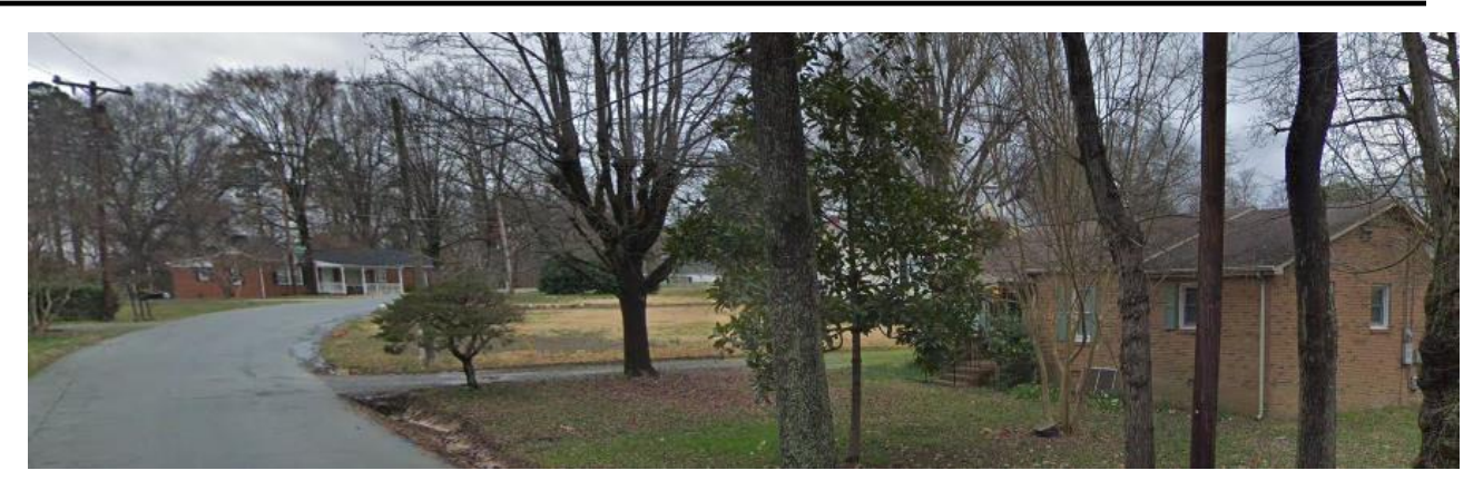
The properties to the north along Chapman Street are developed with single family homes.

Petition 2020-024 (Page 3 of 5) Final Staff Analysis