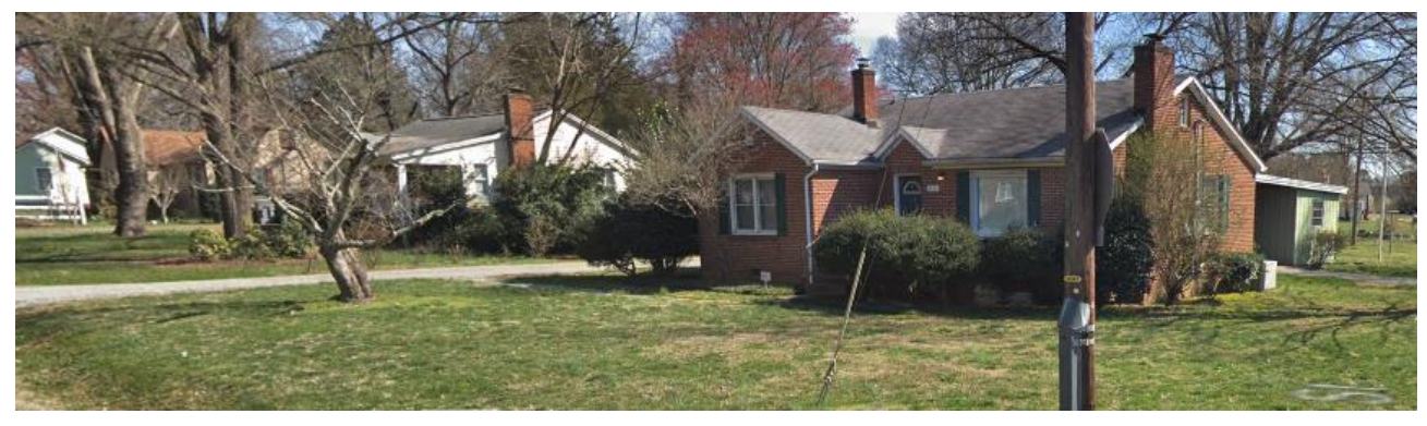
The properties to the south across Old Plank Road are developed with single family homes.