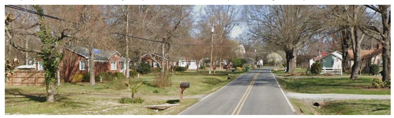
The properties to the east along Old Plank Road are developed with single family homes.