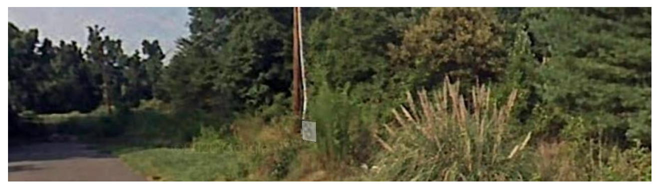
The property to the south is vacant wooded land.