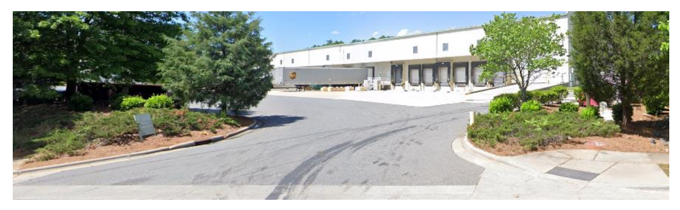
The property to the north is developed with warehouse/distribution uses.

Petition 2021-002 (Page 3 of 5) Final Staff Analysis