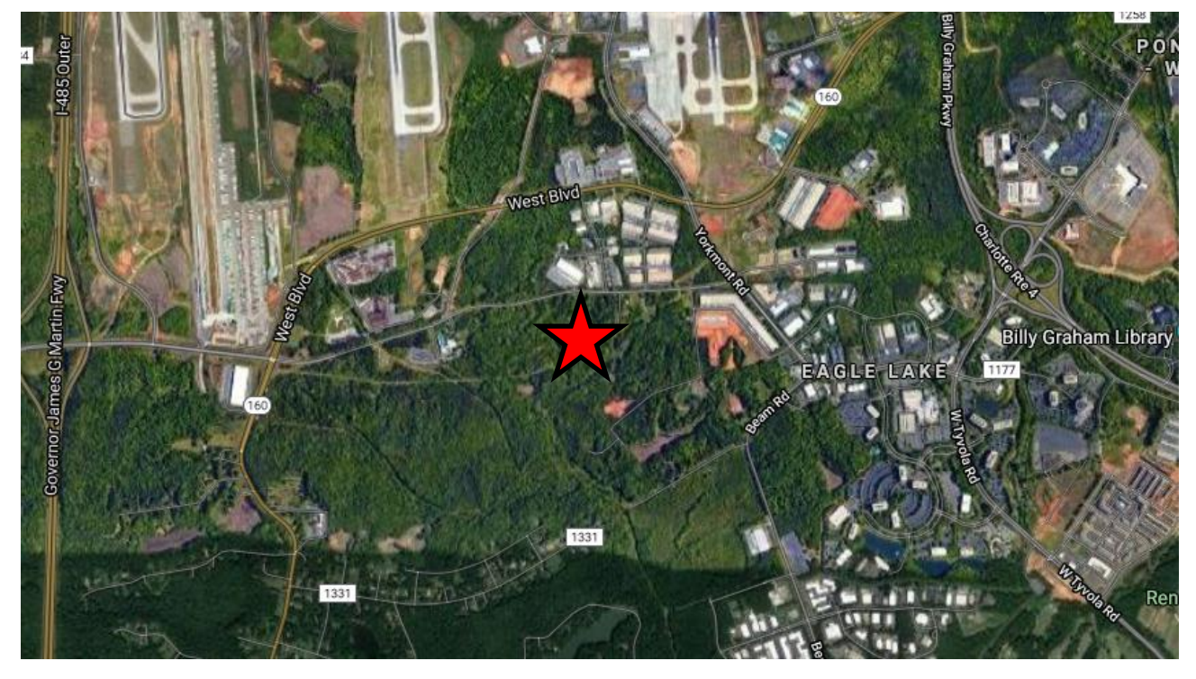
The general location of the subject property is marked with a red star.