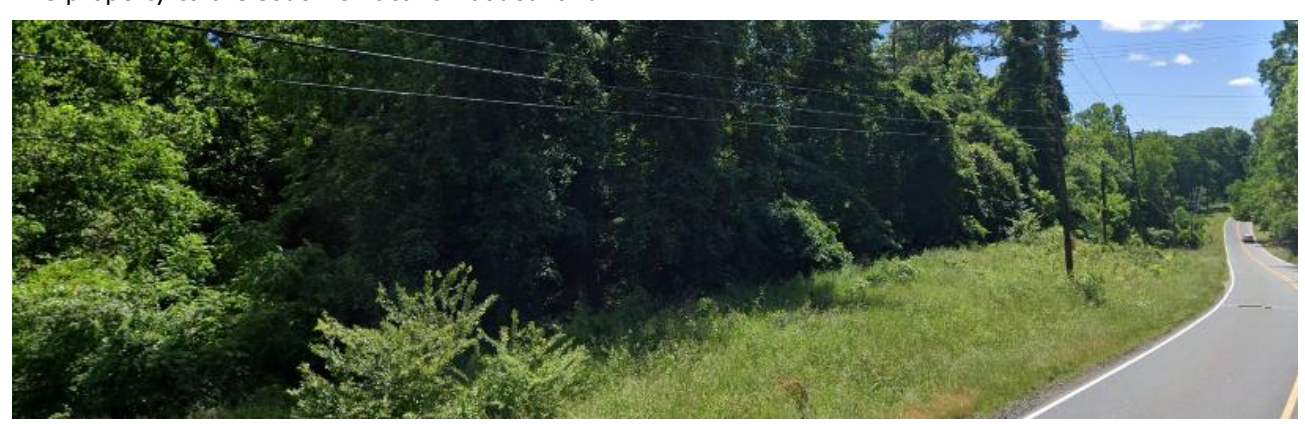
The property to the west is vacant wooded land.