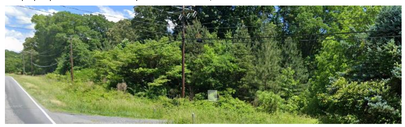
The property to the east is vacant wooded land.