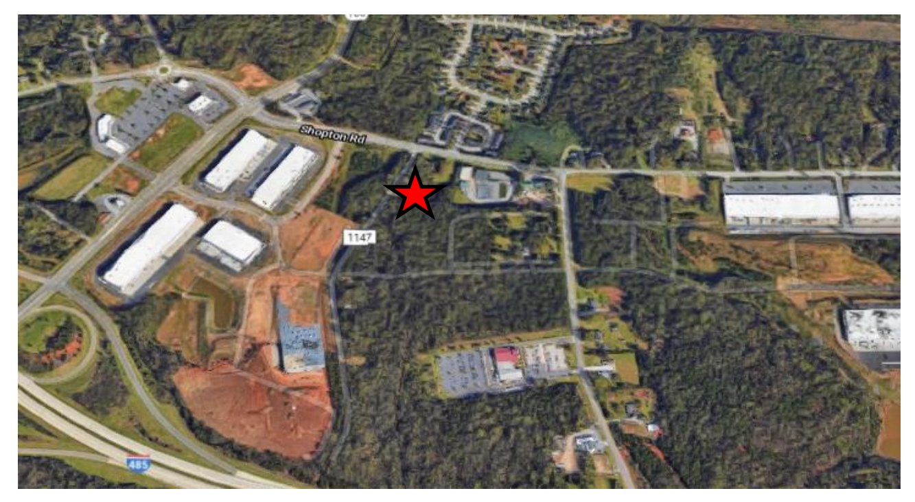
The site is surrounded by a mix of uses including warehouses, a landscaping contractor, and a garden center. The site is marked by a red star.

The existing site is zoned R-3 and I-2. The surrounding land uses include industrial and business zoned properties.