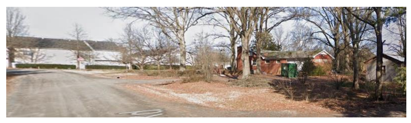
The property to the north is developed with one single family home.