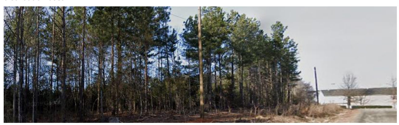
The property to the west is vacant wooded land.