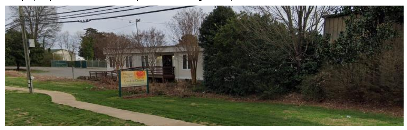
The property to the east is developed with a garden center.