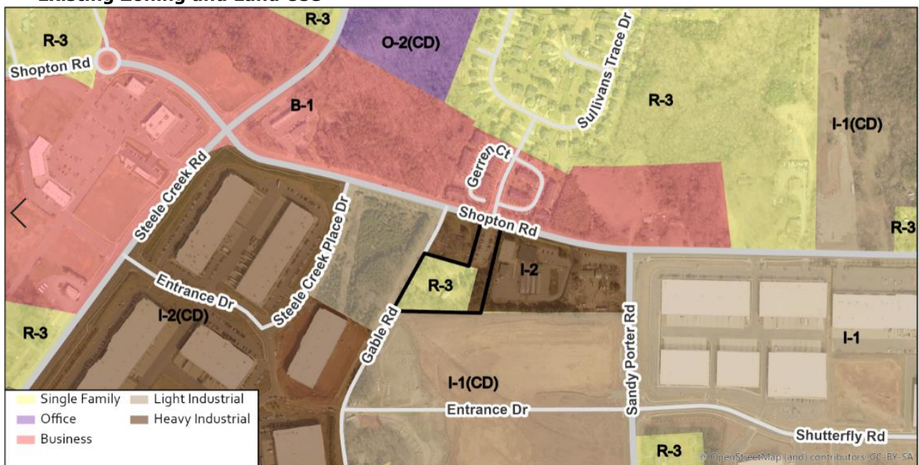
The existing site is zoned R-3 and I-2. The surrounding land uses include industrial and business zoned properties.