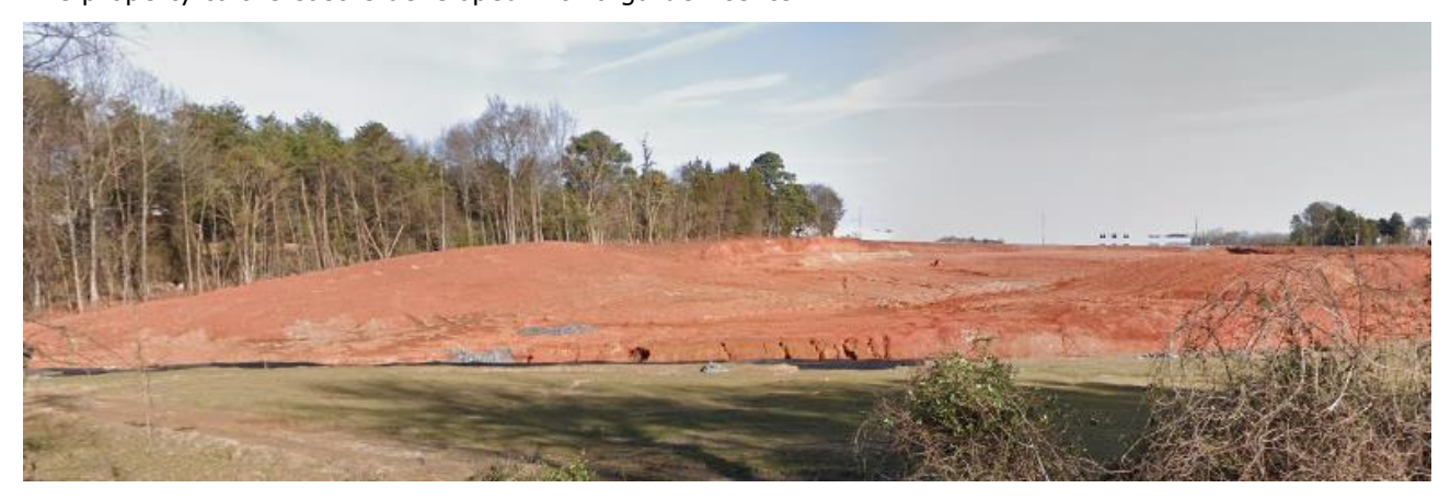
The property to the south is being developed with up to 525,000 square feet of industrial, office, and distribution uses.