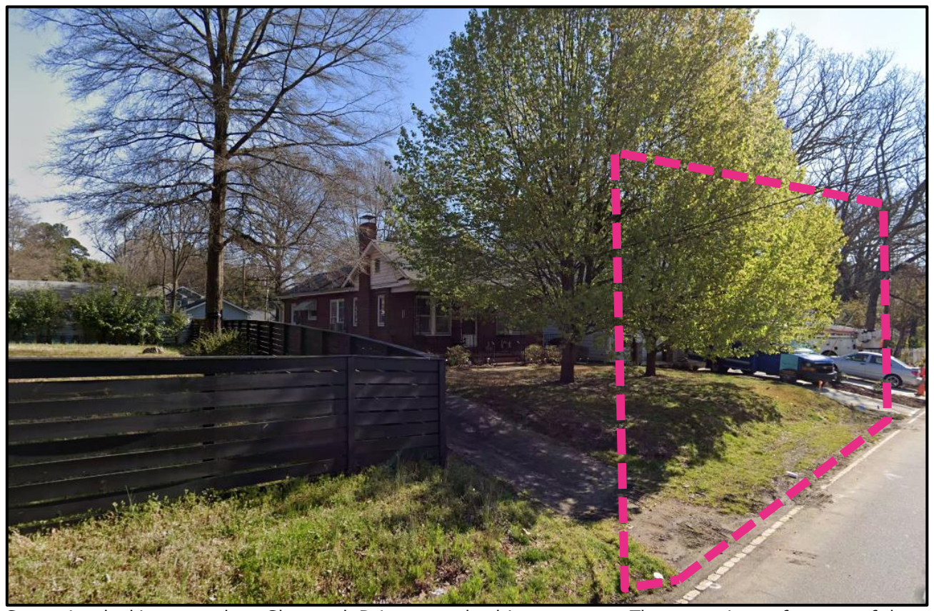
Streetview looking east along Shamrock Drive toward subject property. The approximate frontage of the parcel being rezoned is outlined in a pink dashed line.