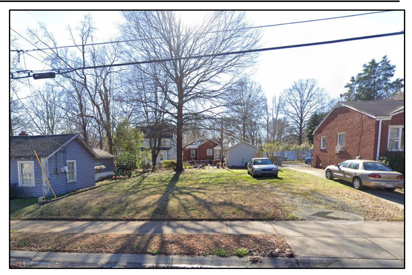
Looking south toward the rear yard of the subject property along Downs Ave.