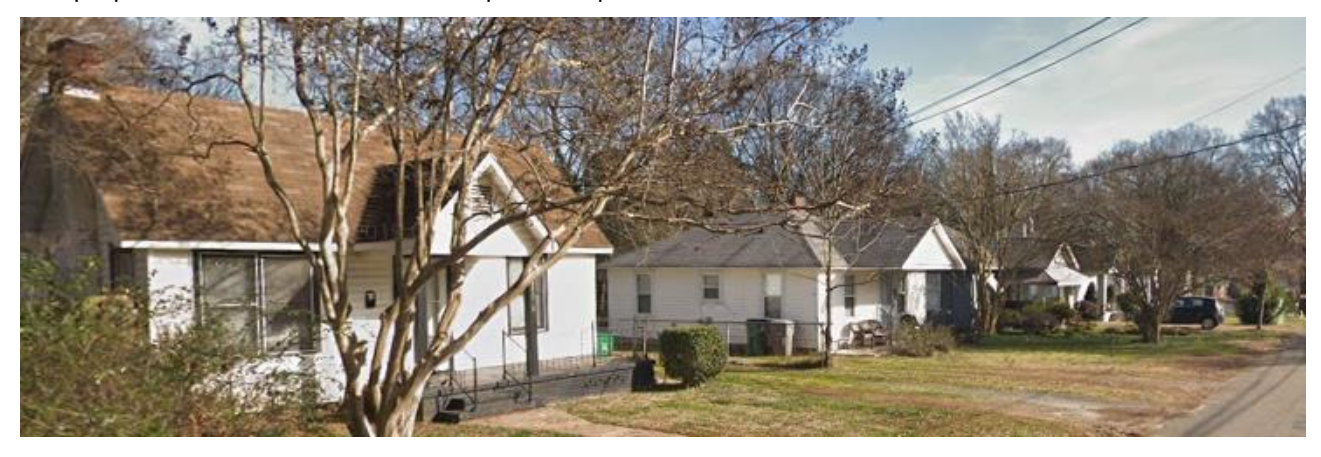
The properties to the west are developed with residential uses.