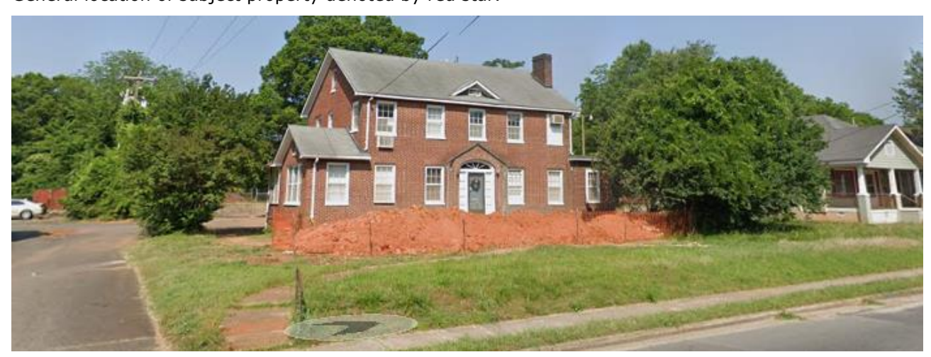
View of the site from Tuckaseegee Road.