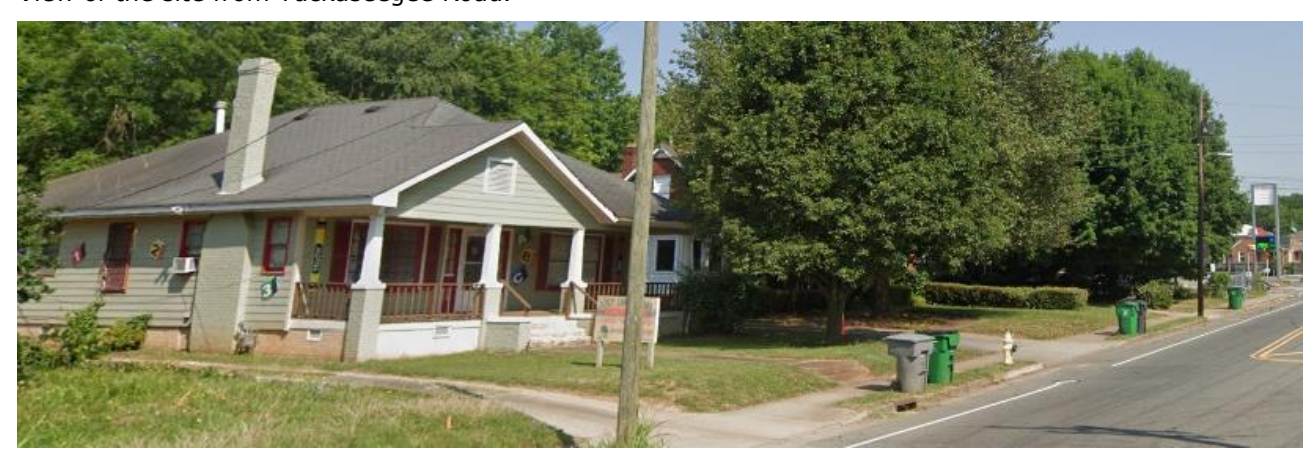
The properties to the north are developed with residential and institutional uses.