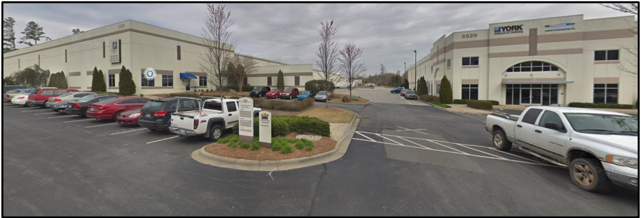
The property to the West along Lakeview Road is developed by office/warehousing uses.