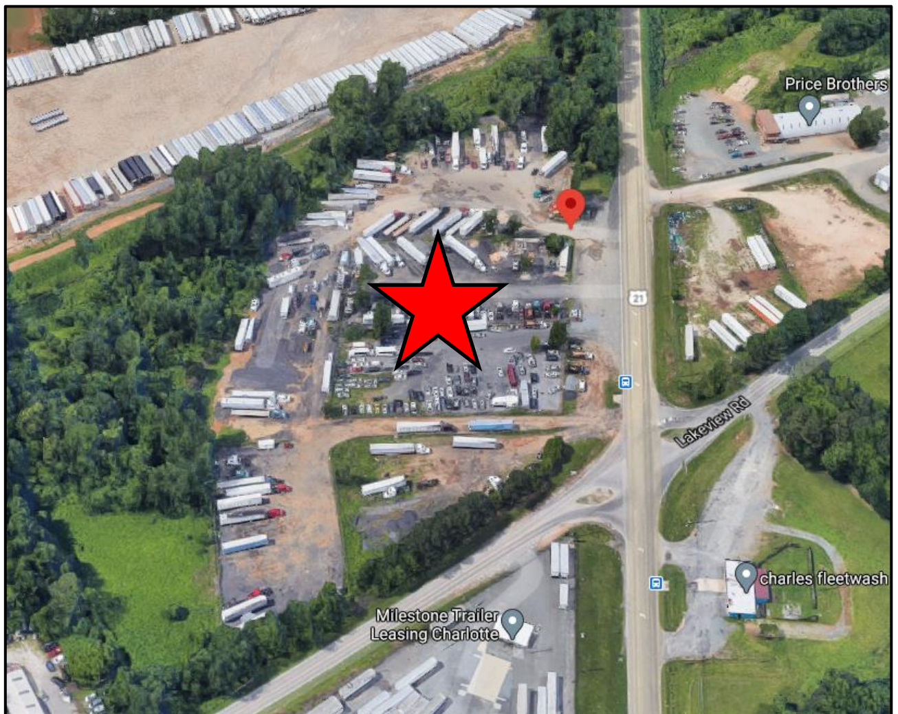
The subject property (denoted with red star).