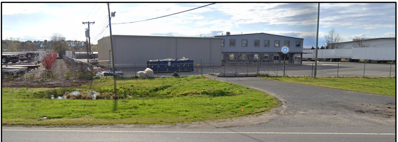
The property to the north along Statesville Road is developed with a trailer dealership.