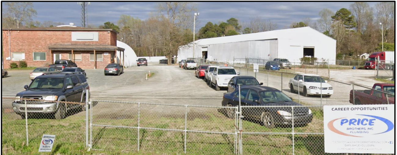
The property to the east along Statesville Road is developed with a plumbing contractor.