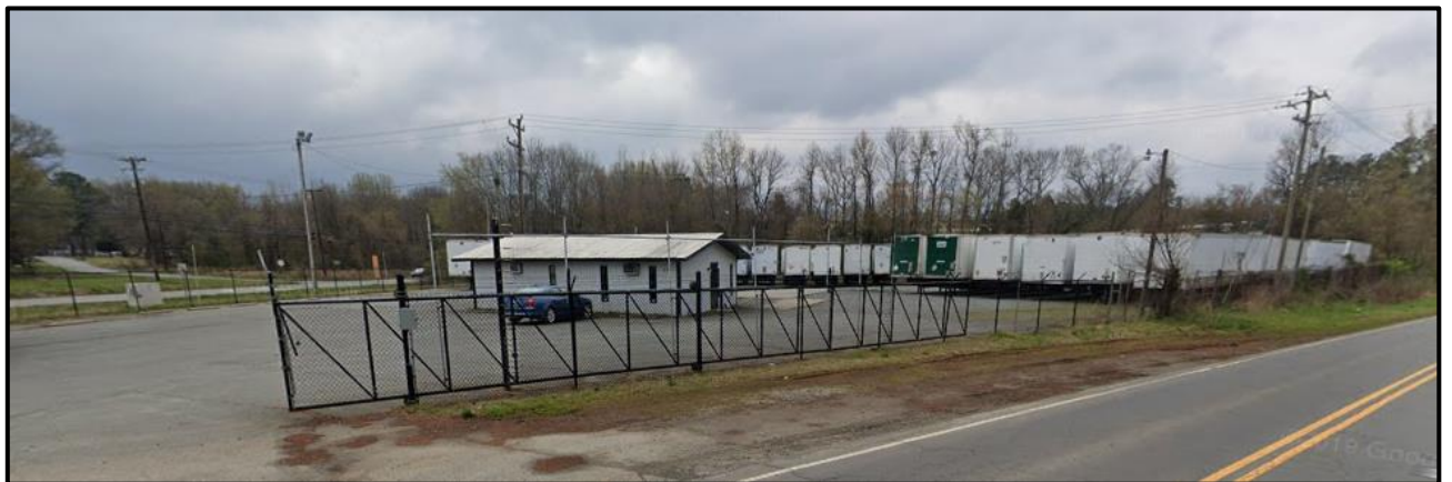
The property to the south along Lakeview Road is developed with a vehicle storage/leasing yard.