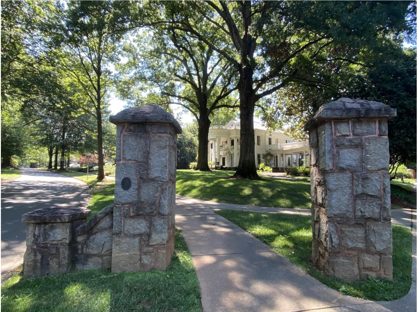
Fig. 1: Setting