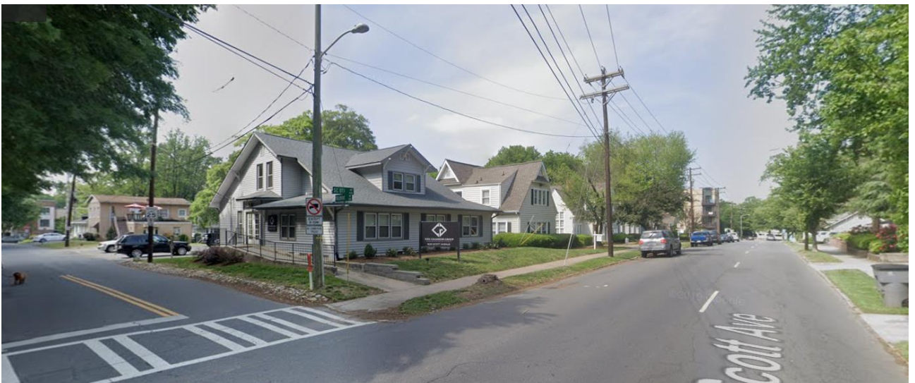
North, along Scot Avenue, are residential and nonresidential uses.