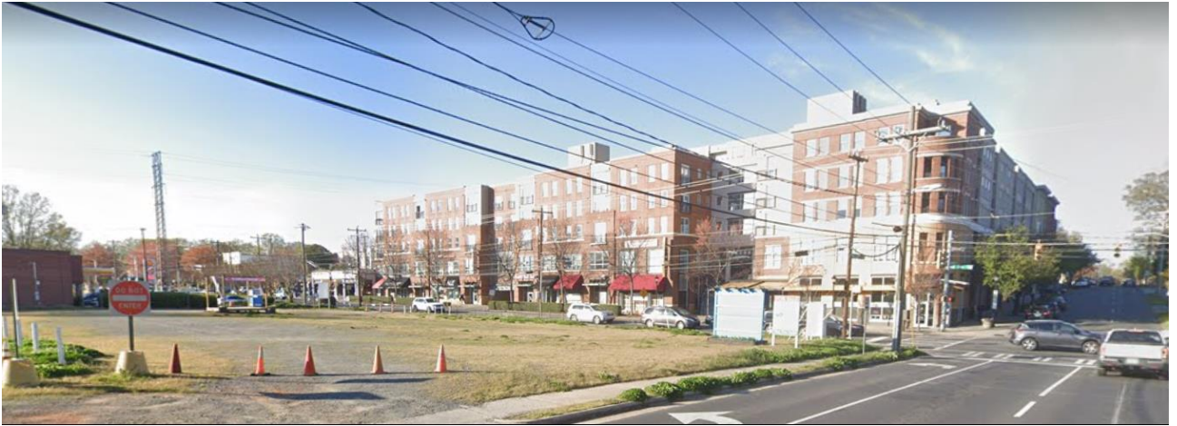
Mixed use development, commercial, and residential uses are located north of the rezoning site.