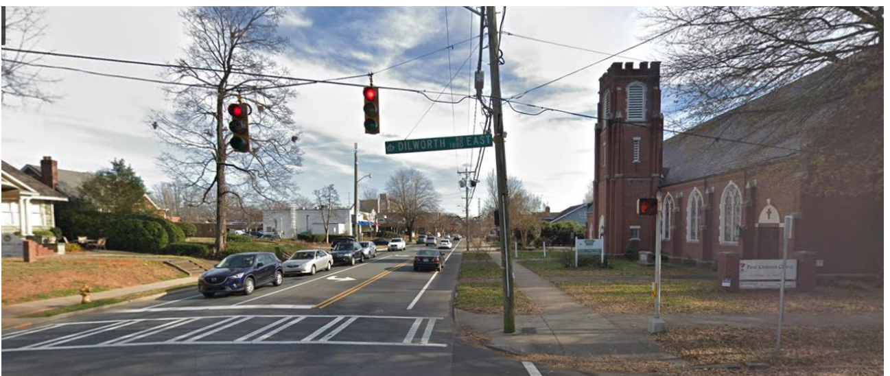
Along East Boulevard are institutional, office, residential and retail uses.