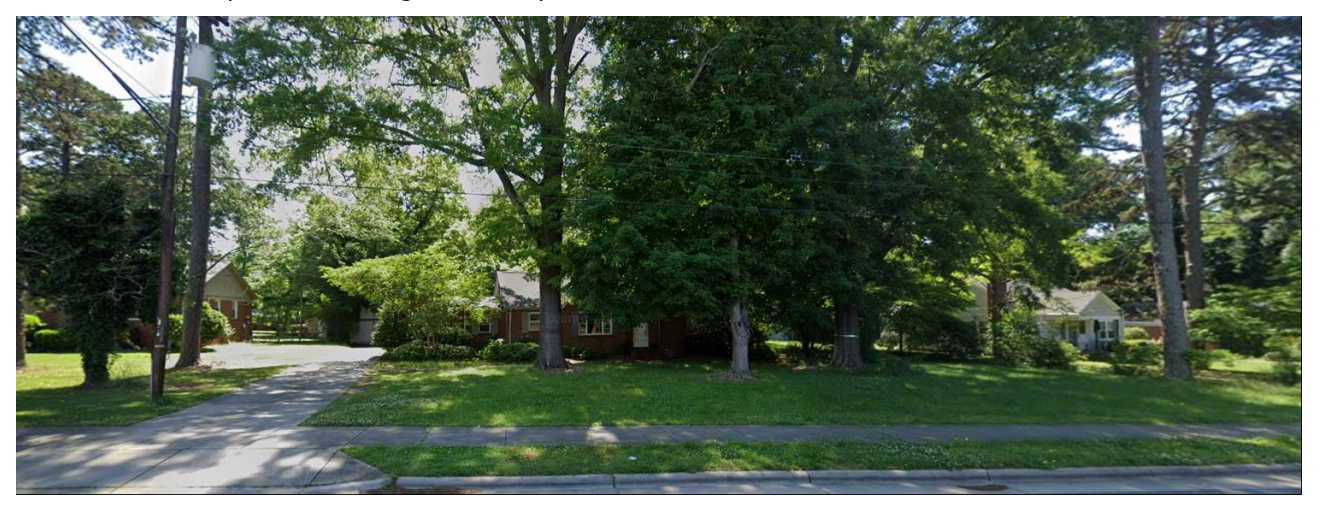
West, across Briar Creek Road, are single family homes.

The site is developed with a religious facility.