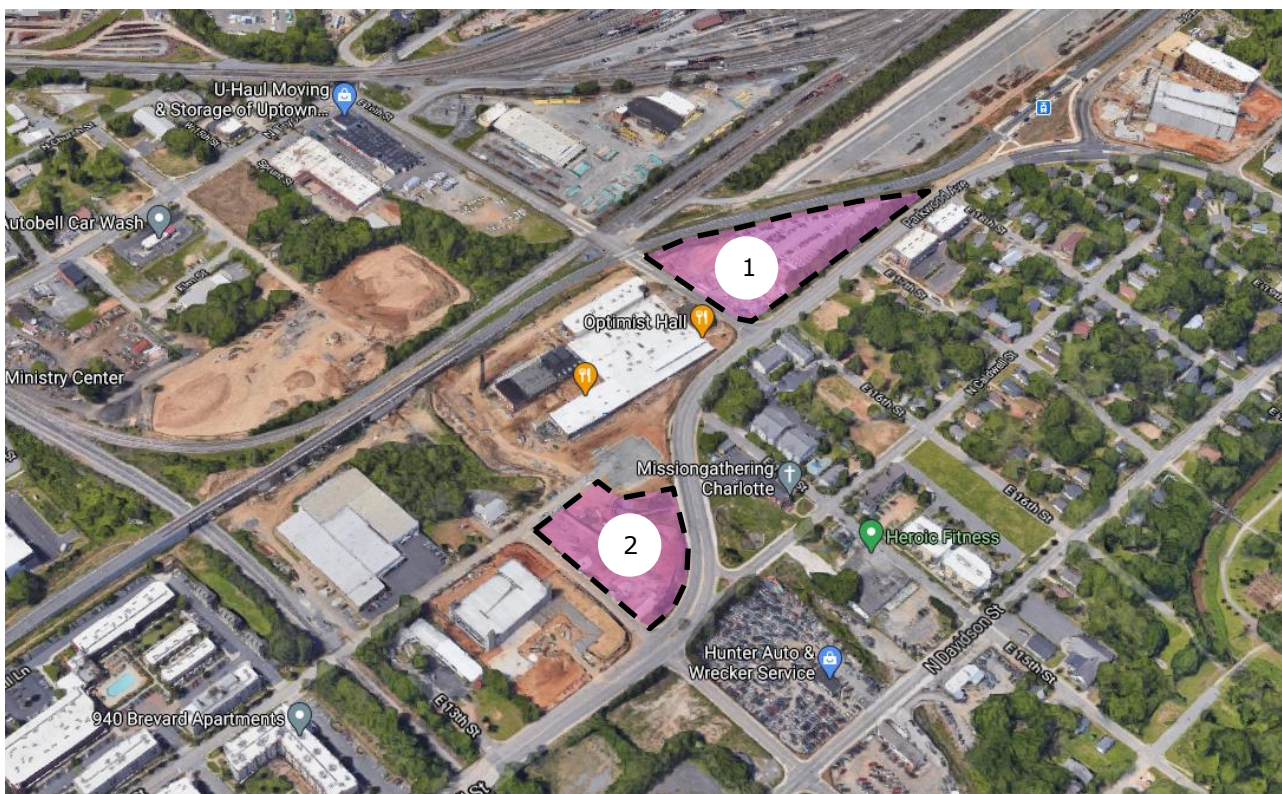
General location of site(s) illustrated above. Area 1 (top) contains two of the three parcels related to this petition.