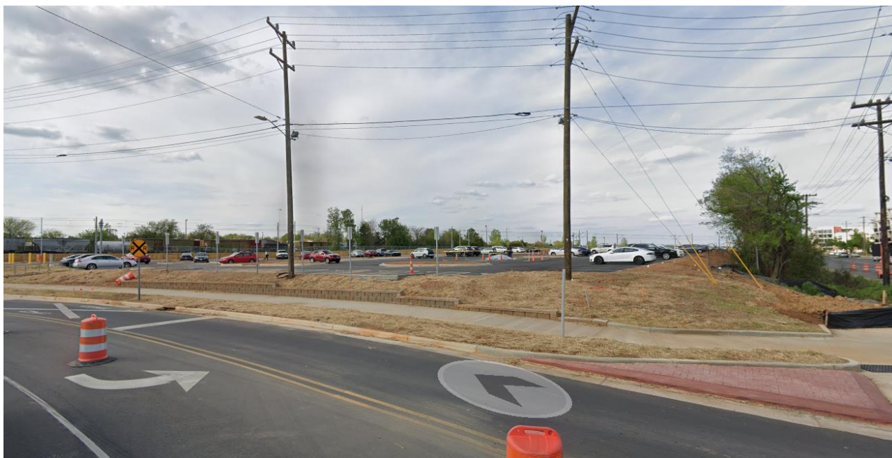
Area 1 (which contains two (2) of three (3) parcels) as seen from E. 16 th Street looking north toward the Parkwood Station. This area is currently operating as a surface parking lot for Optimist Hall.