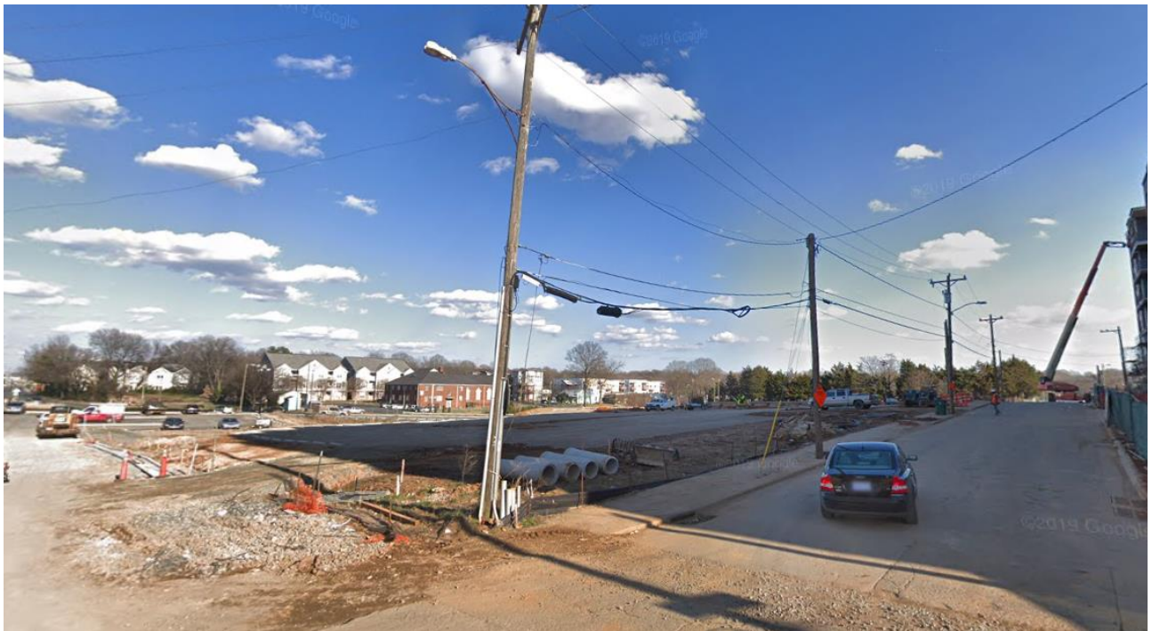
Area 2 as seen from N. Brevard Street looking east. This photo does not reflect existing conditions, as the site is currently operating as surface parking for Optimist Hall.