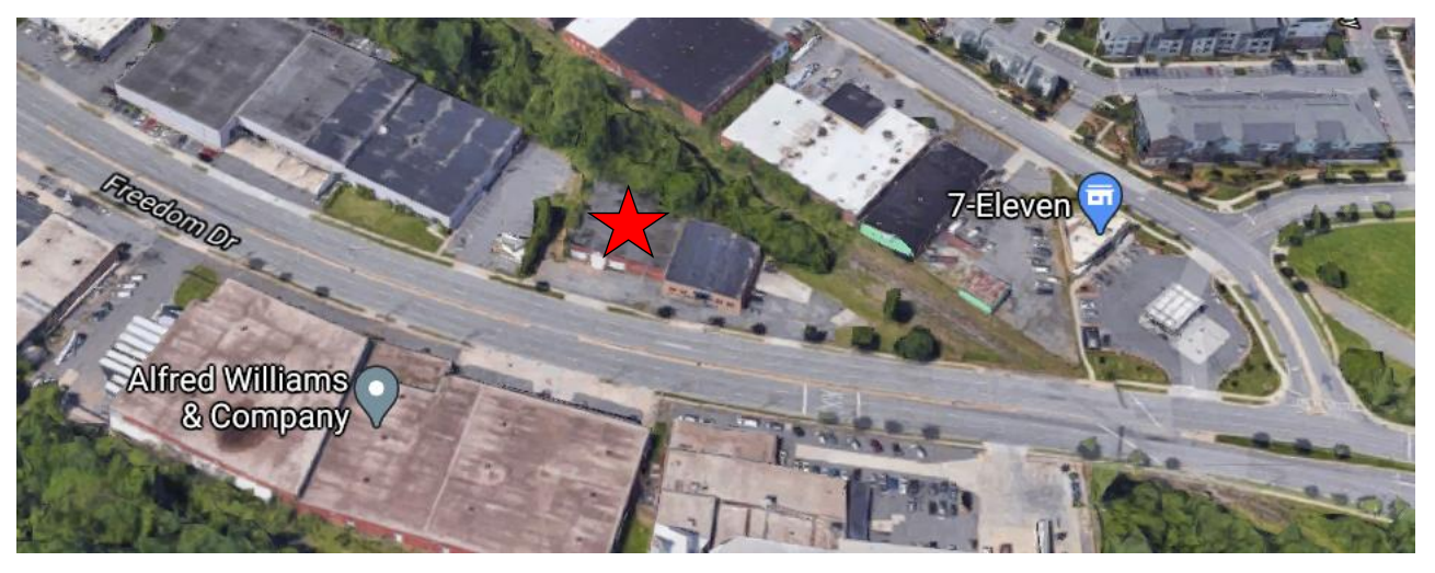
The site, marked with a red star, is developed with a vacant warehouse.

The site is developed with a warehouse. Adjacent properties along Freedom Drive are developed with warehouses and occupied by industrial and commercial businesses. Some similar warehouses on Thrift Road have been renovated to accommodate office and commercial uses.