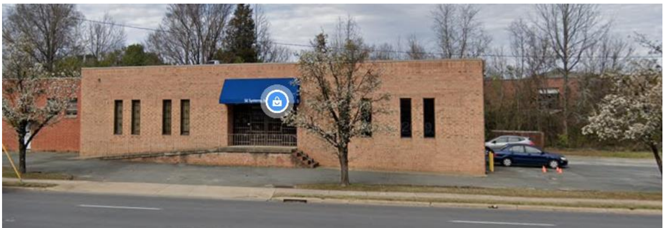
The site to the east is developed commercial uses.