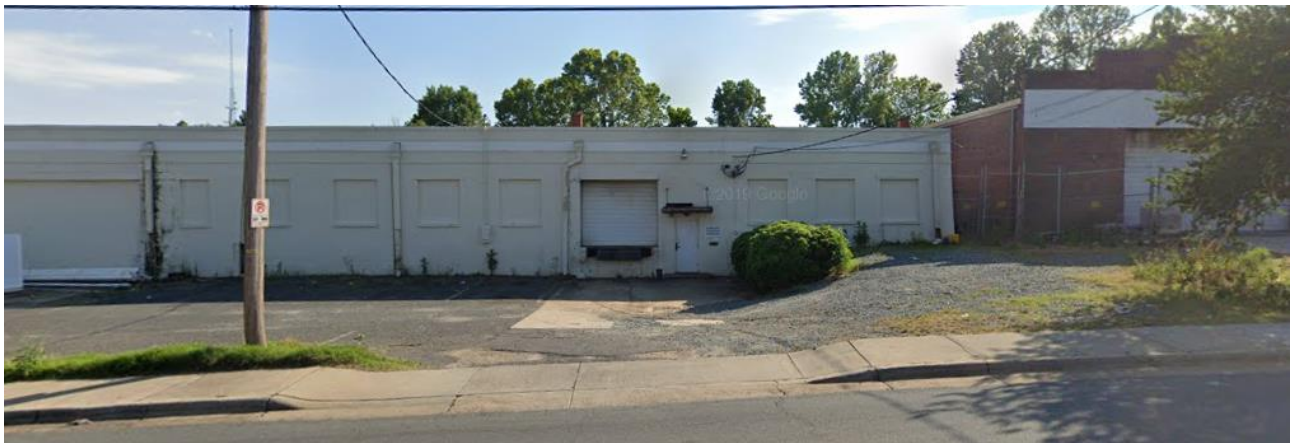
The site to the north is developed with industrial uses.