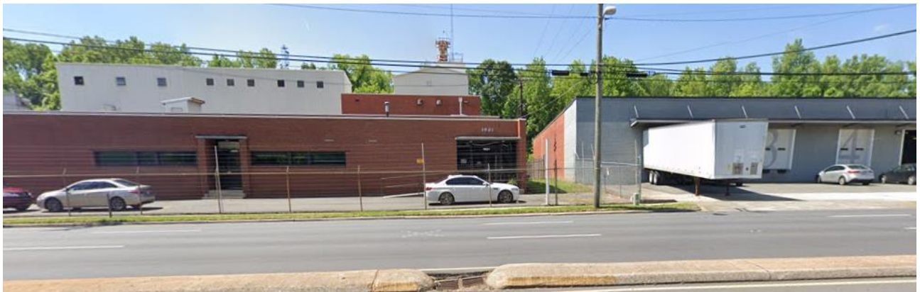
The site to the south is developed with commercial and industrial uses.