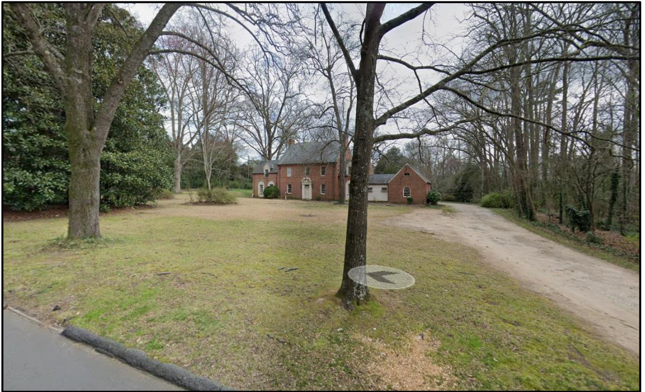
Streetview from Mecklenburg Avenue looking southeast toward the subject property. The Shaw House can be seen in the background and would be rehabbed with this petition.