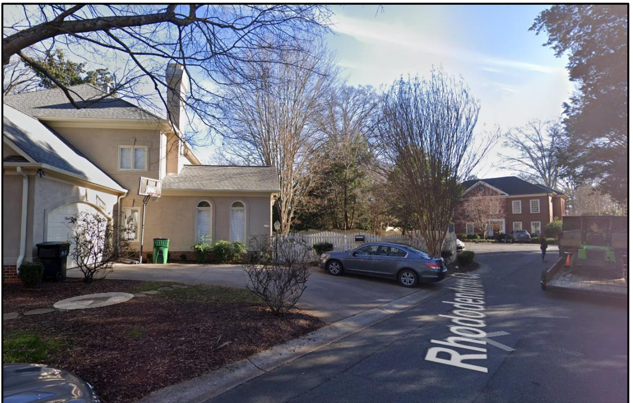
Streetview along Rhododendron Court to illustrate neighborhood context.