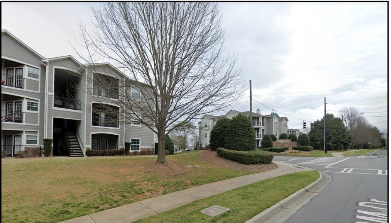
The property to the west of the site along IBM Drive is developed with multi-family apartments.