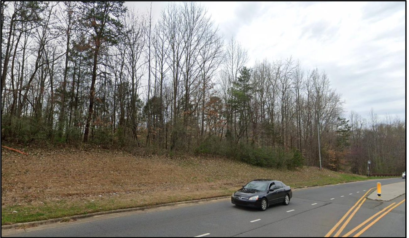
Streetview from IBM Drive looking west toward the site.