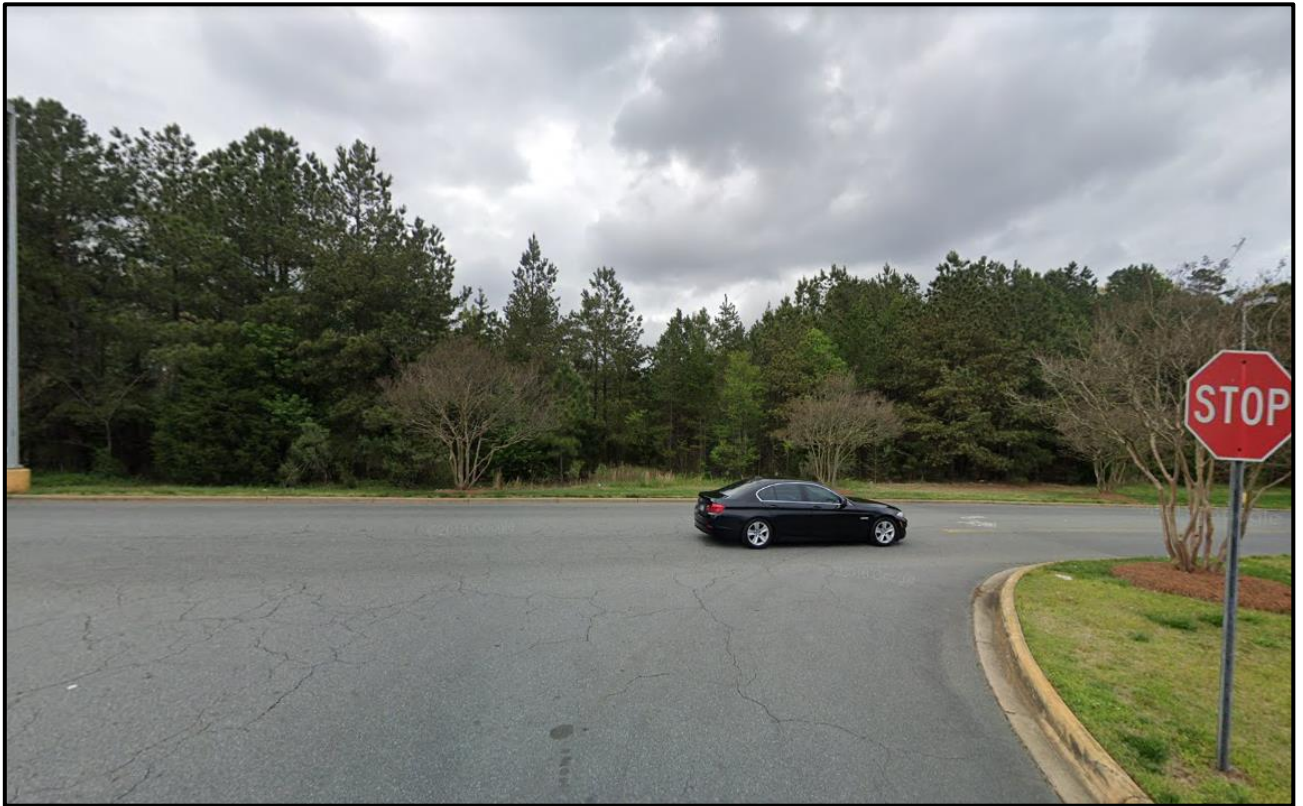
Streetview along Shopping Center Drive looking north toward subject property.