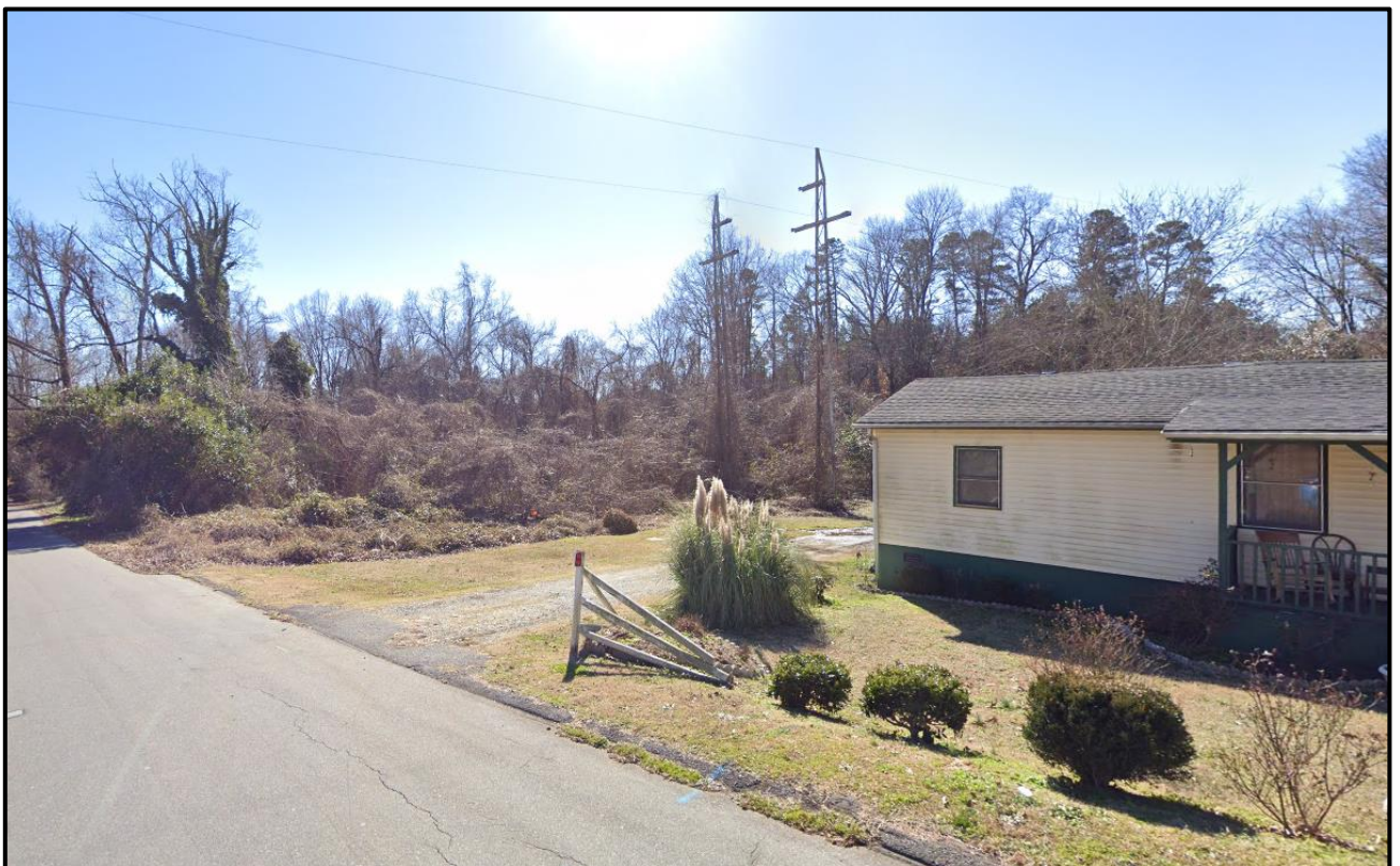
Streetview illustrating residential areas along Hampton Church Road with the subject property in the background of the image.