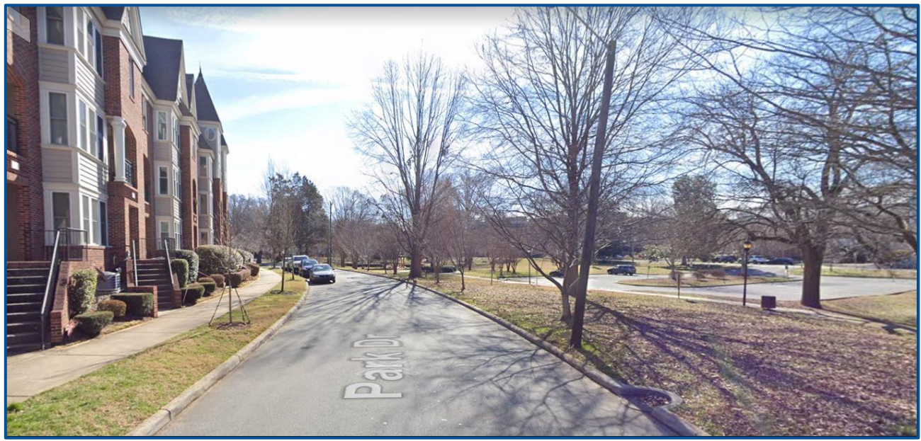
Directly south are townhomes/condominiums. Across Park Drive is Independence Park.