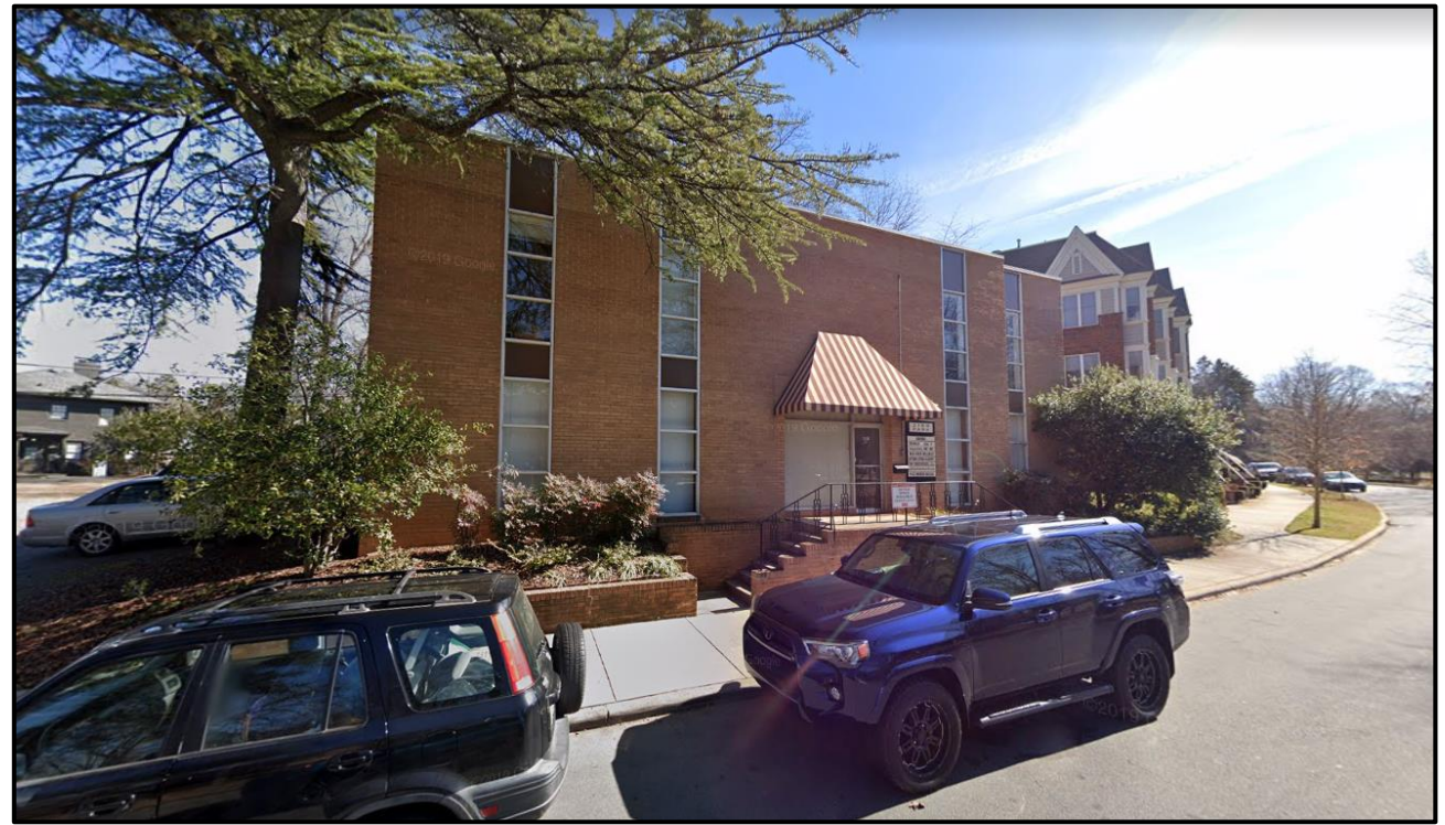
The site is developed with an office building constructed in 1920.

• The rezoning site (identified by the red star) is just across the street from Independence Park and is surrounded by a mix of residential and non-residential uses.