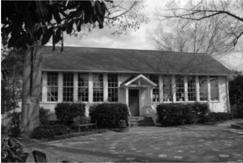
The Caldwell Station is another example of rural schoolhouse design within Mecklenburg County in the 1920s. Caldwell Station, NC. Stewart Gray, “Caldwell Station School” (Charlotte- Mecklenburg Historic Landmarks Commission, 2010).

was planned by the county borrowing inspiration from the efficient design framework outlined in the Rosenwald School Bulletin . As the county was erecting Rosenwald schools, the same design typologies were borrowed for rural white schools.