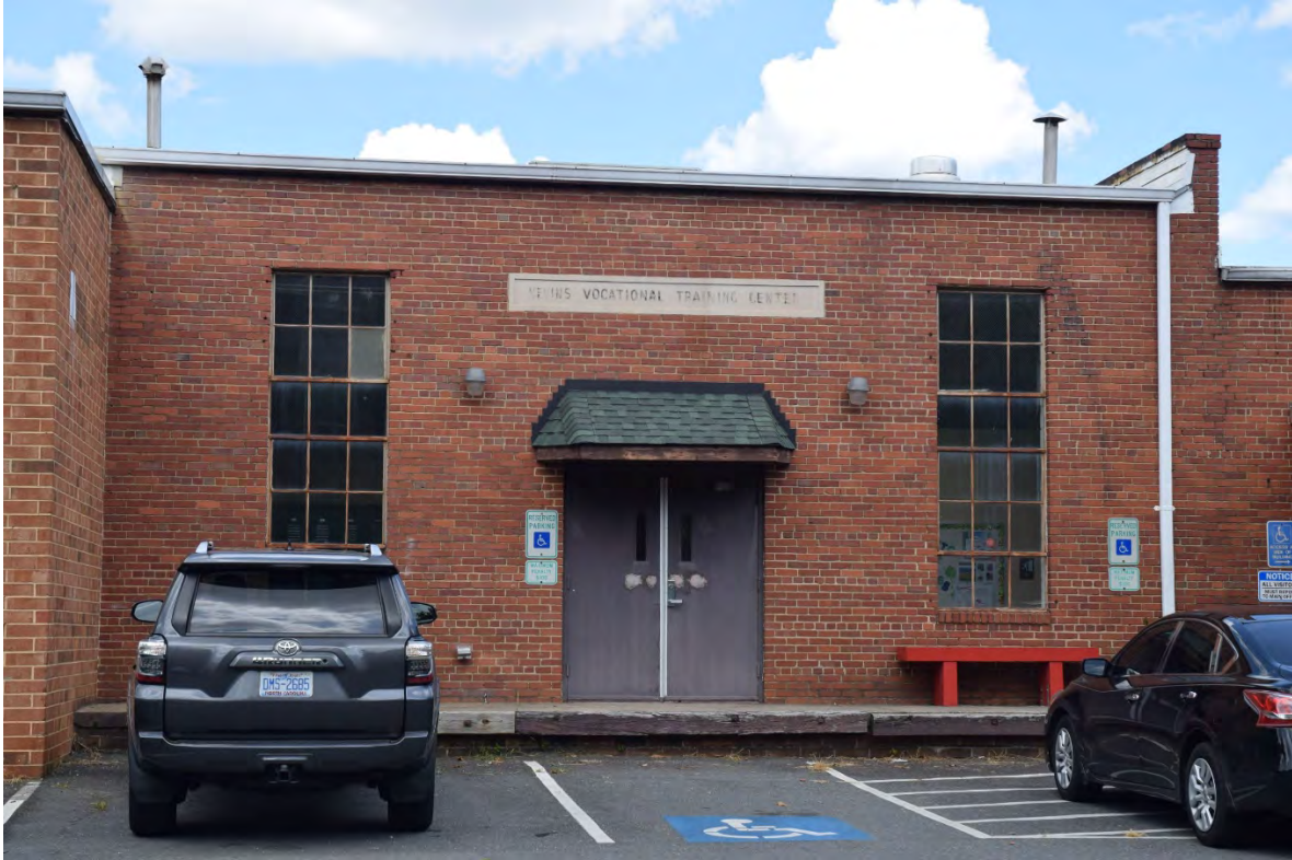
Auditorium West Elevation