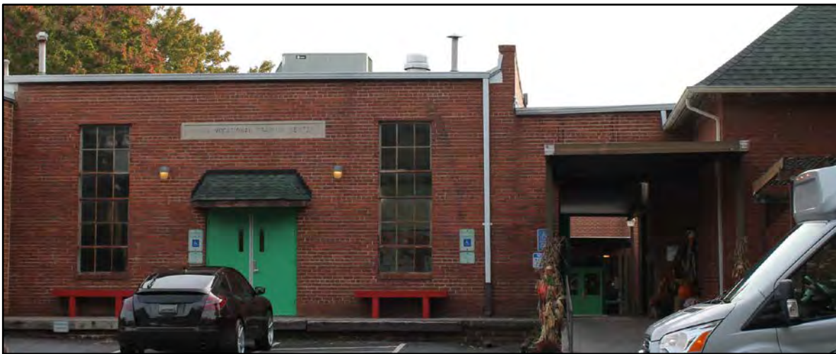
The Nevin Auditorium’s entrance faces west and connects to the Nevin schoolhouse via brick breezeway. October 25, 2018.