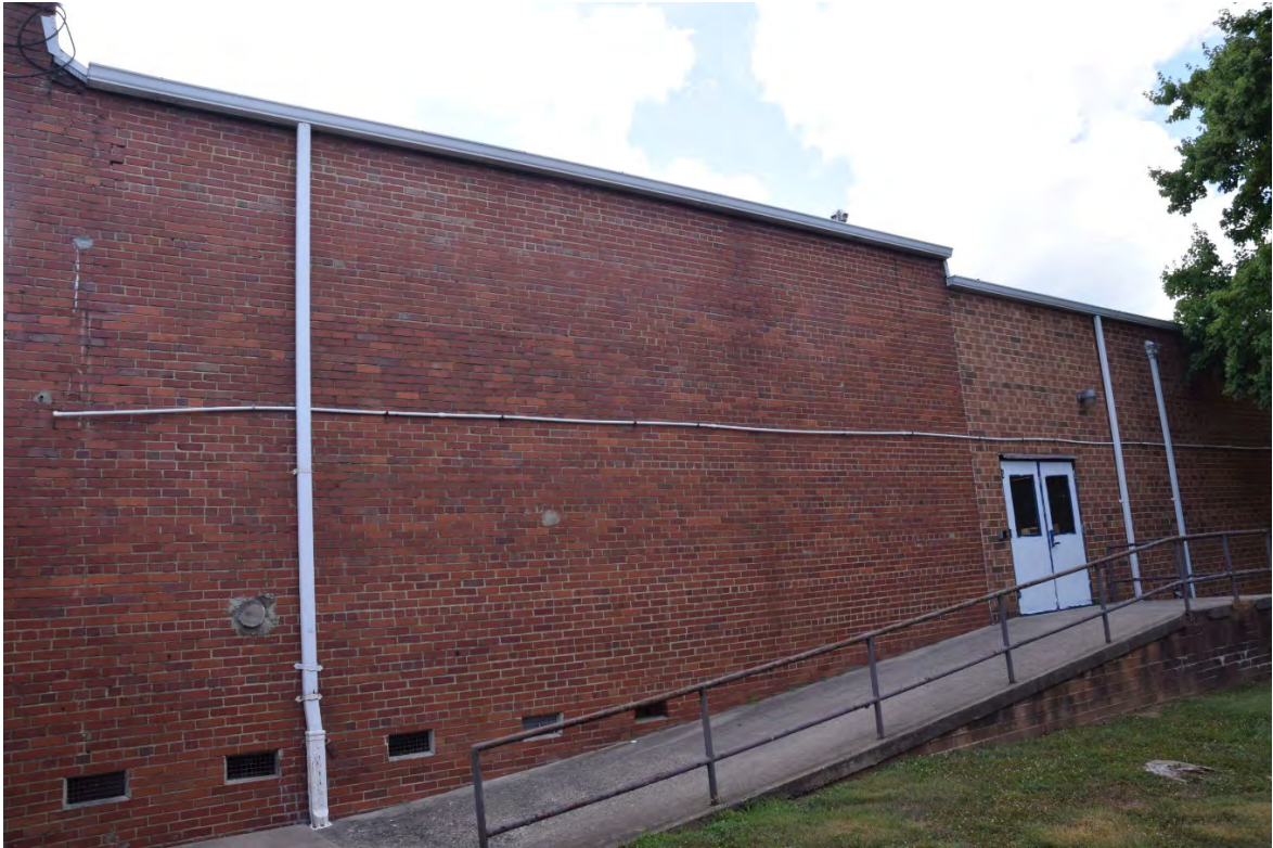
Auditorium East Elevation