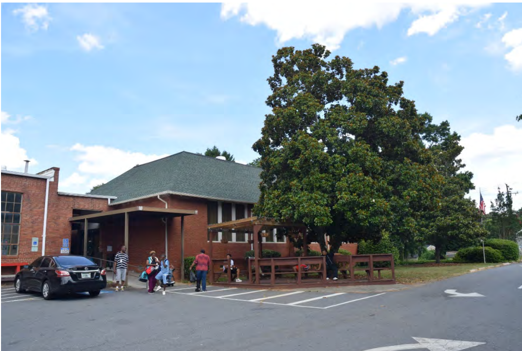
View from Northwest