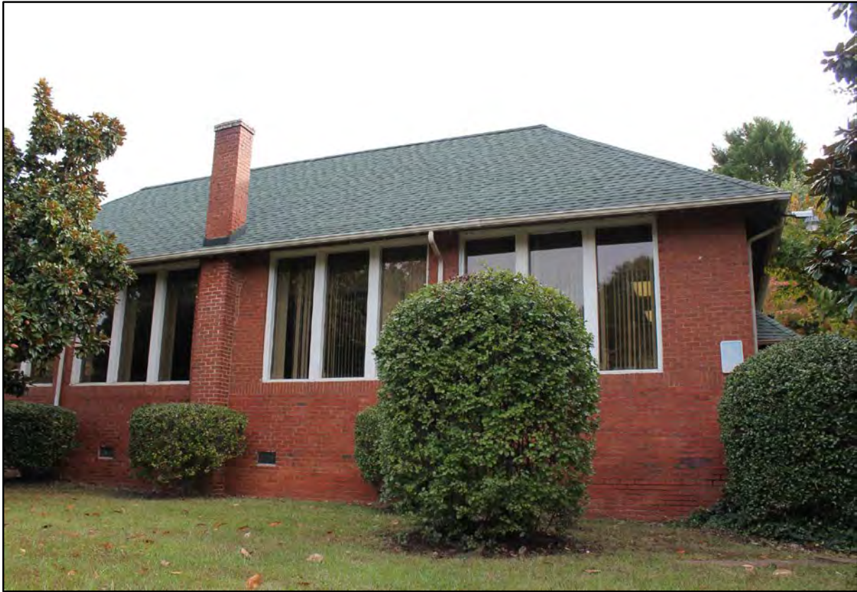
Nevin schoolhouse west-facing facade, Nevins, Inc. October 25, 2018.

The Nevin schoolhouse is a one story, brick-veneered building with a mansard roof covered in asphalt shingles. The building features a brick veneer of stretcher bond with a sill band articulated by a single row of soldier-coursed bricks wrapping around the entire building below the windows. The steeply-pitched mansard roof features low-hanging eaves. The schoolhouse sits upon its original continuous-brick foundation, with non-dimensional lumber girders spanning across the length of the building. There is a small basement for mechanical equipment with a bulkhead entrance slightly left of the chimney on the west elevation.