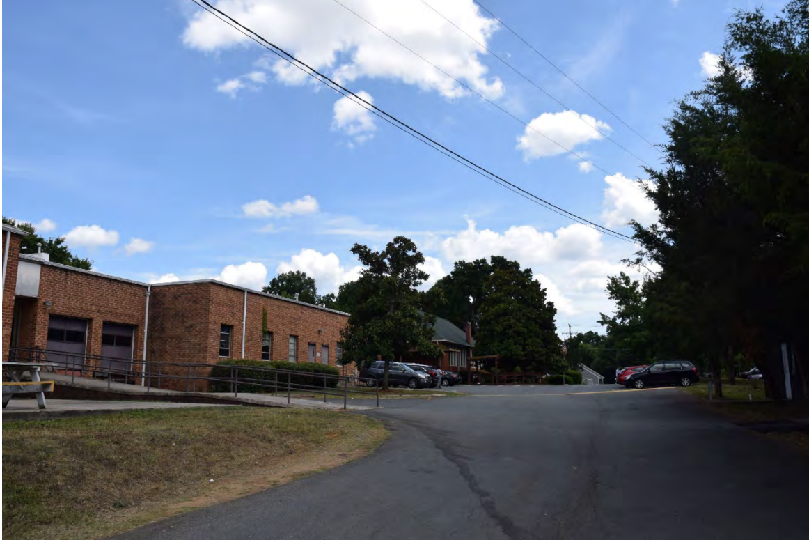
School Property -View from the North – Auditorium Obscured