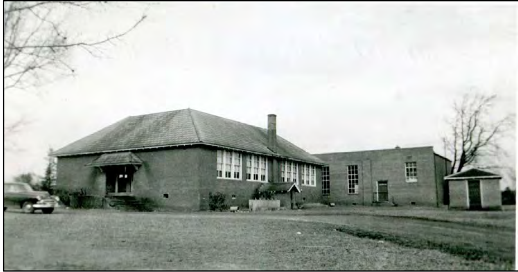
Nevin School and Auditorium.