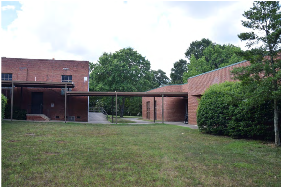
School Property –View from the South of the Eastern Portion of the Property Including 1940 Auditorium