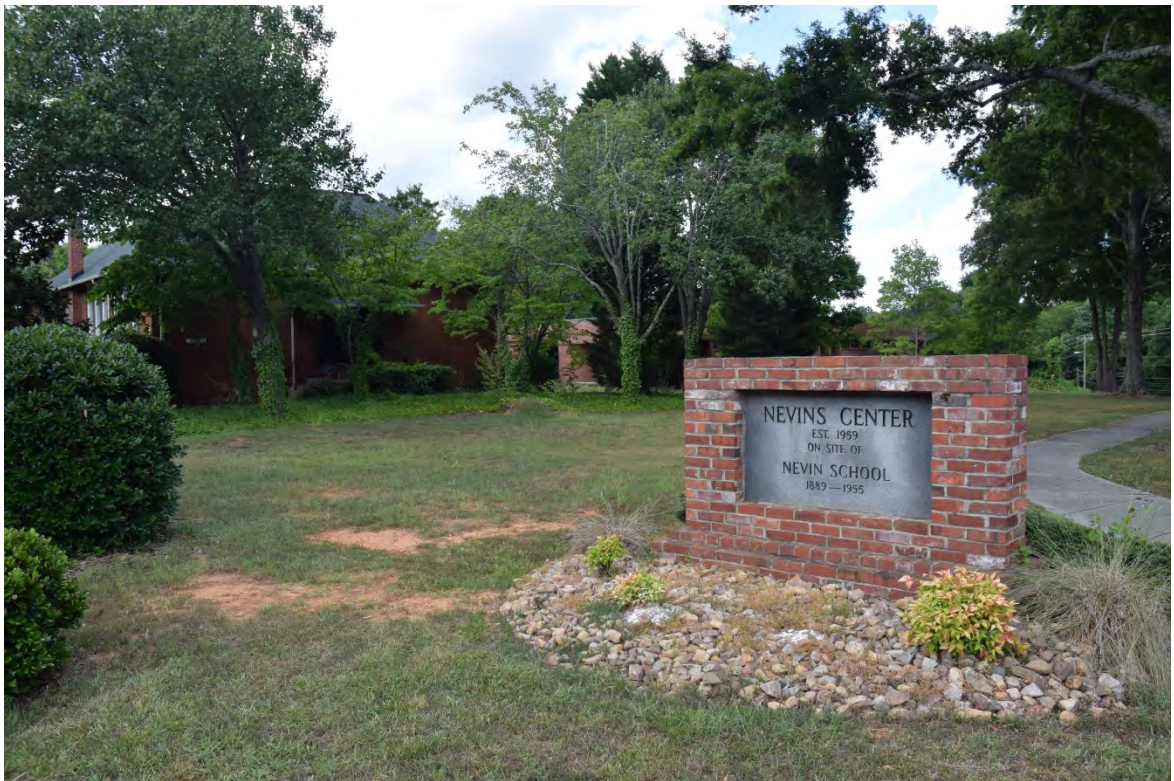
School Property from the Southwest