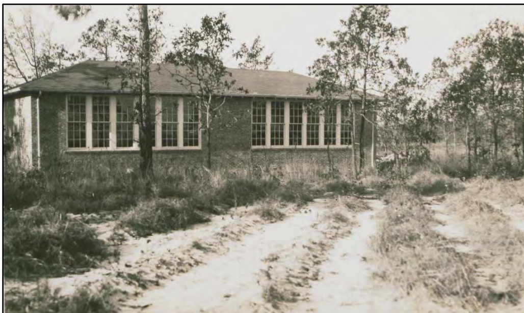
A brick Rosenwald school in Scotland County, NC with a similar facade to the Nevin School. Rosenwald Fund Schoolhouse. Division of Negro Education.

The most distinguishable difference between the 1923 Nevin school building and the similar Rosenwald plan, is the Nevin building's lack of a significant point of entry along the east or west-facing facade like in the.