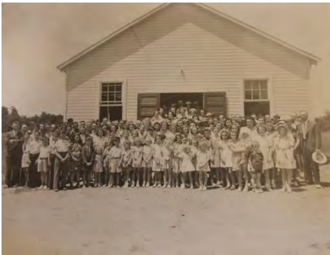
Statesville Avenue Baptist Church, Nevin Community. Ca. 1920s.