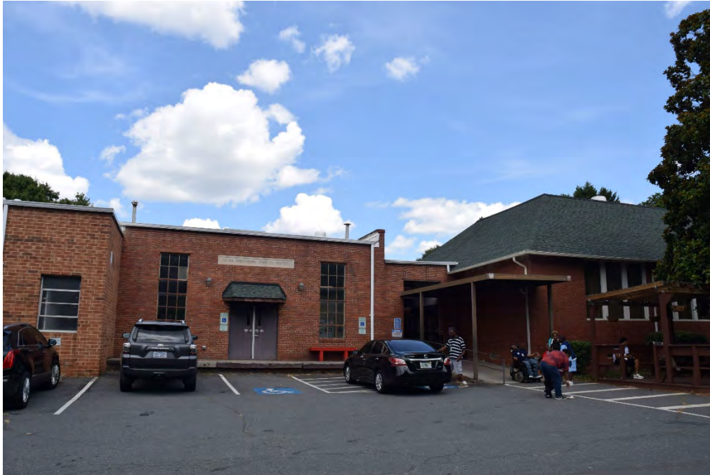
1923 School Building and 1940 Gymnasium

The auditorium connects to the 1923 building through a brick breezeway. A brick parapet running along the schoolhouse-facing facade of the auditorium creates a division between the breezeway and the auditorium. The addition of the brick breezeway altered the auditorium-facing facade of the schoolhouse and is the only significant alteration to the exterior of the schoolhouse since it was built in 1923.