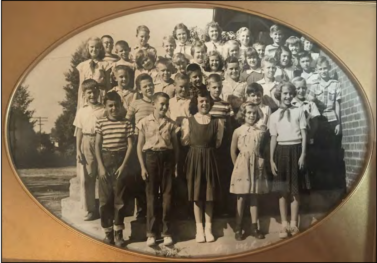
Final fifth grade class portrait at the Nevin School. ca. 1955.