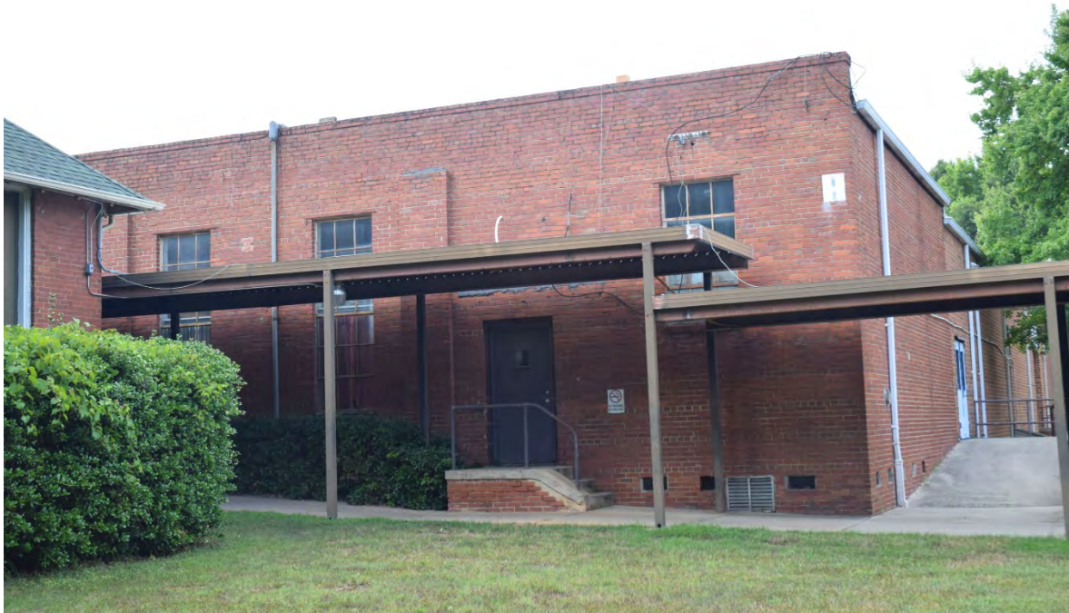
Auditorium South Elevation