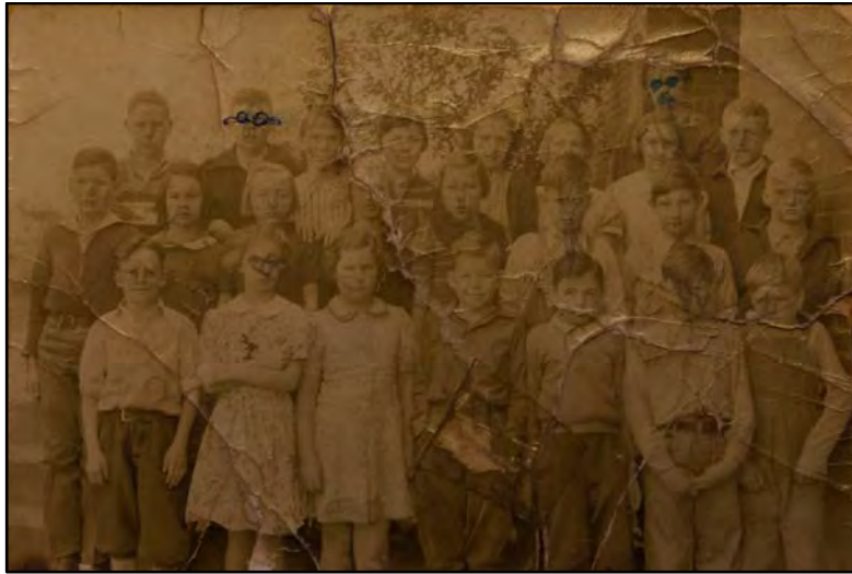
Class portrait on the front steps of the Nevin School. ca. 1930.