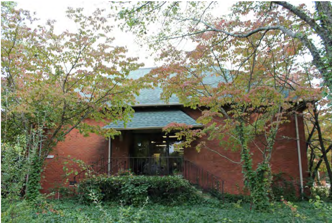
Nevin schoolhouse south, street-facing facade, Nevins, Inc. October 25, 2018.

The north and south elevations both feature a centrally-aligned entryway with no window opening. The south facade, facing Nevin Road, features a recessed entryway sheltered by an asphalt-shingle hipped-roofed porch. The original entrance bay contains a modern glass storefront-style door and windows. A porch extends from the south entry bay with concrete steps protruding from east and west sides. The north entry bay features an automatic sliding door. A covered-brick breezeway extends from the north entry bay to the auditorium entrance.