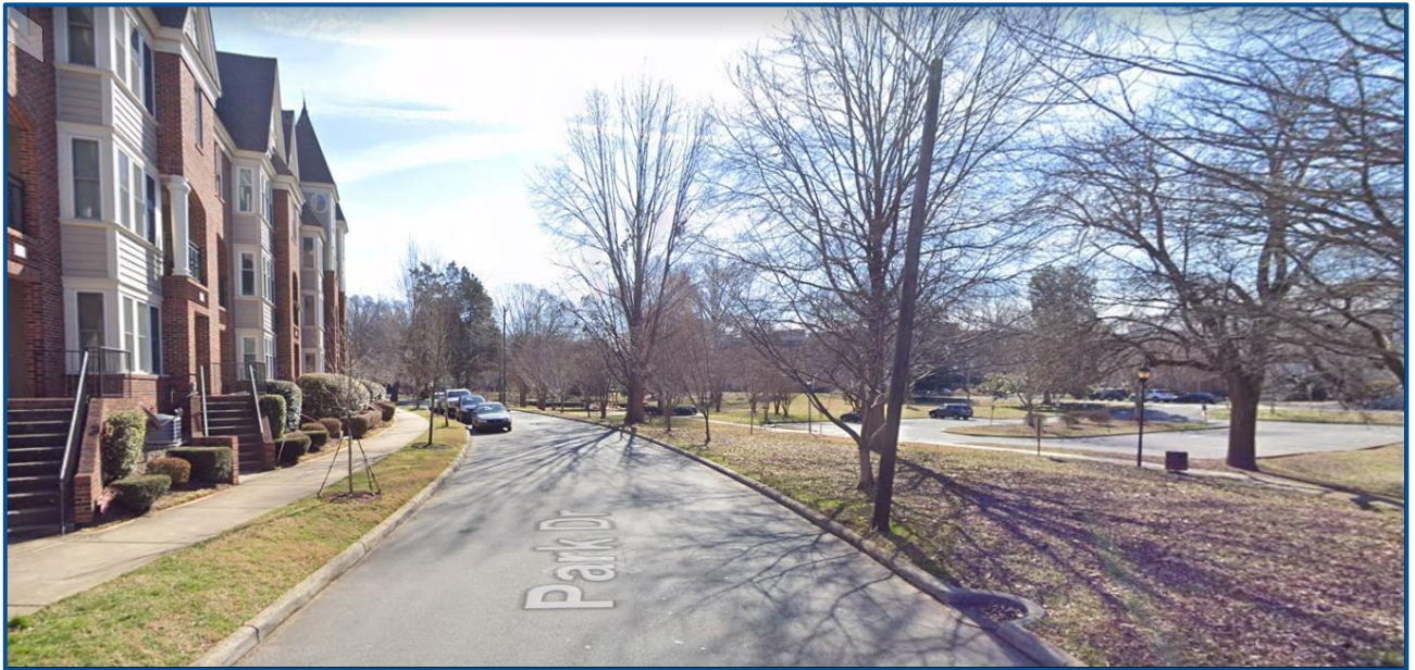
Directly south are townhomes/condominiums. Across Park Drive is Independence Park.