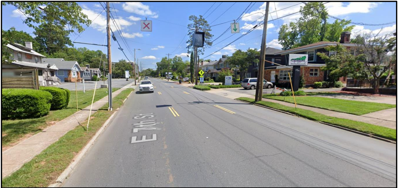
Along East 7 th Street is a mix of businesses and residential uses.