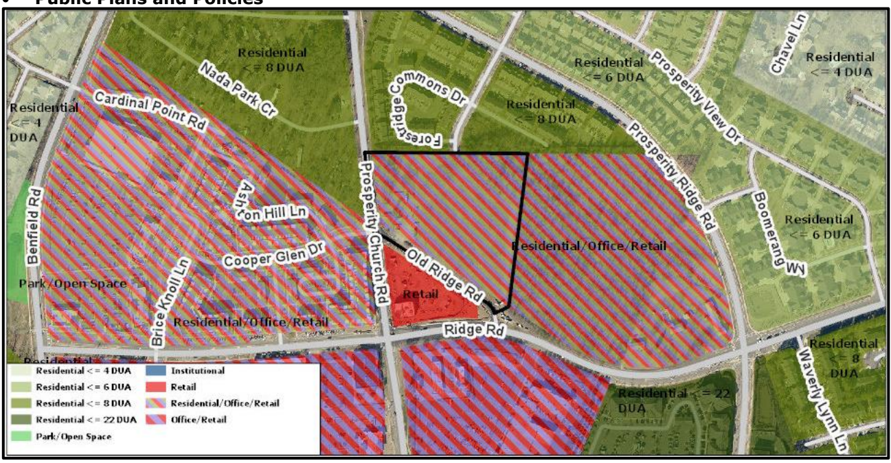
• The Prosperity Hucks Area Plan (2015) recommends residential/office/retail for this site.