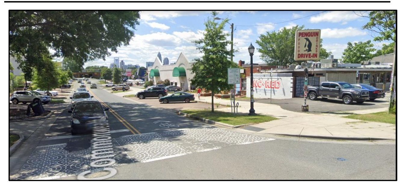
South of the site are commercial uses.

Petition 2019-155 (Page 4 of 6) Final Staff Analysis