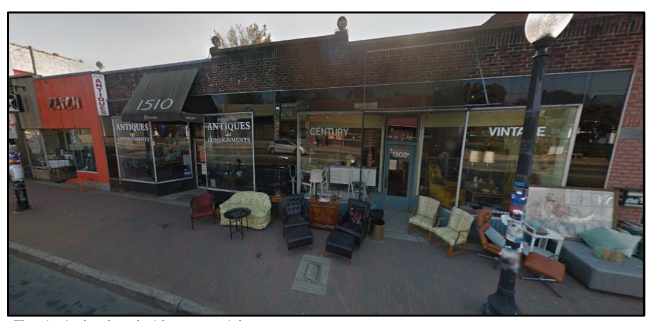
The site is developed with commercial uses.

Petition 2019-155 (Page 3 of 6) Final Staff Analysis