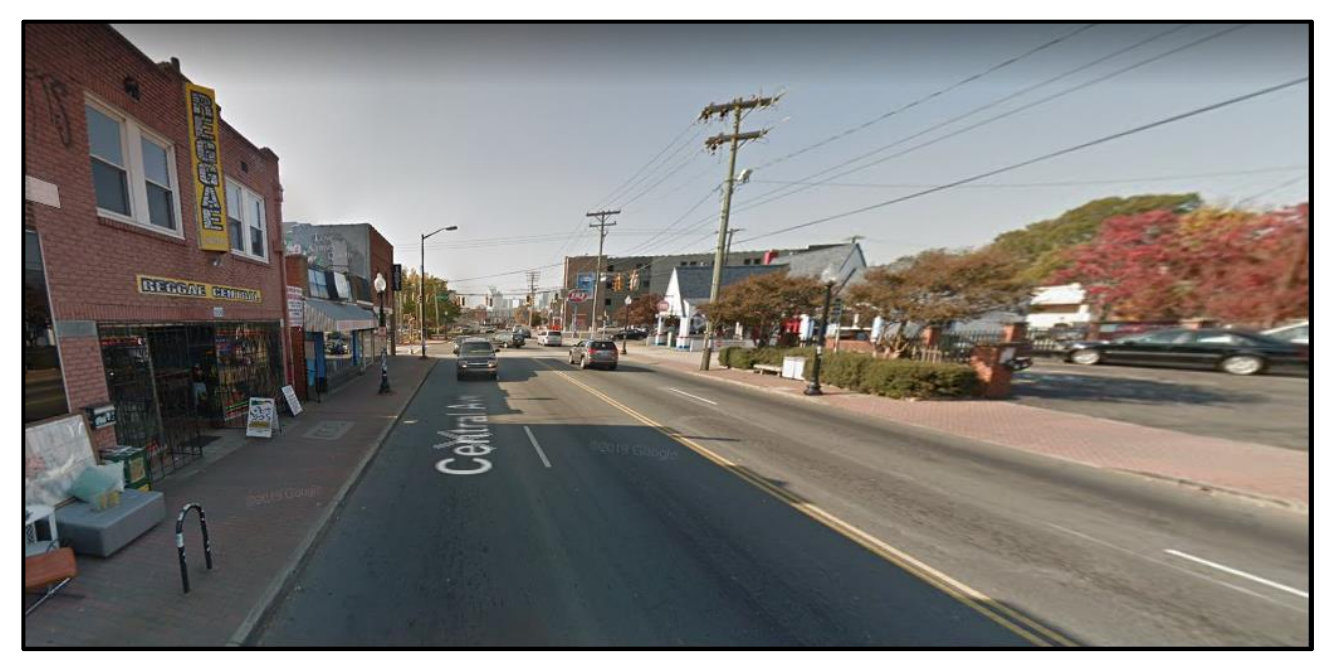
Along Central Avenue are commercial uses.