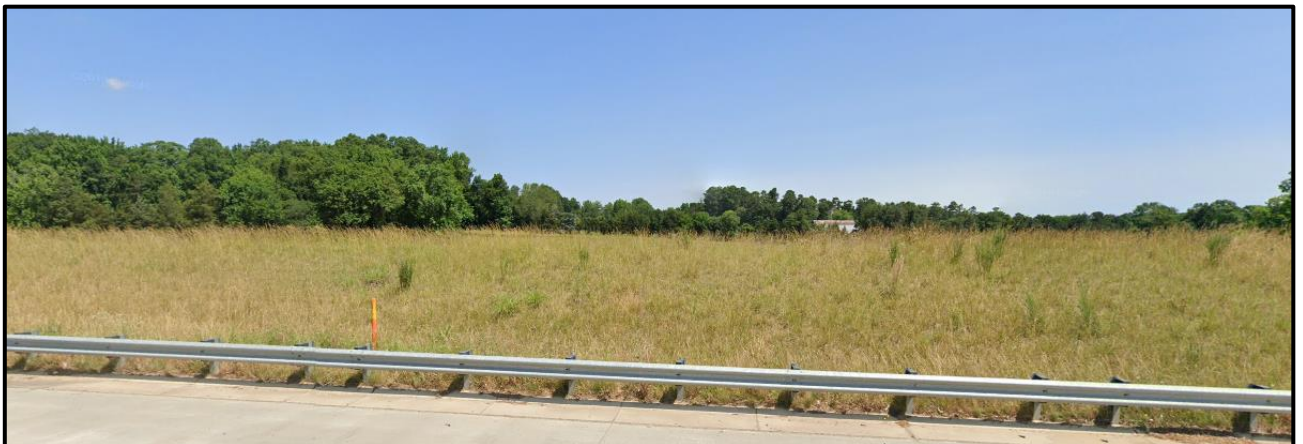
The property to the north bordered by Interstate 485 is currently vacant but rezoning 2019-078 will allow 440 multi-family units.