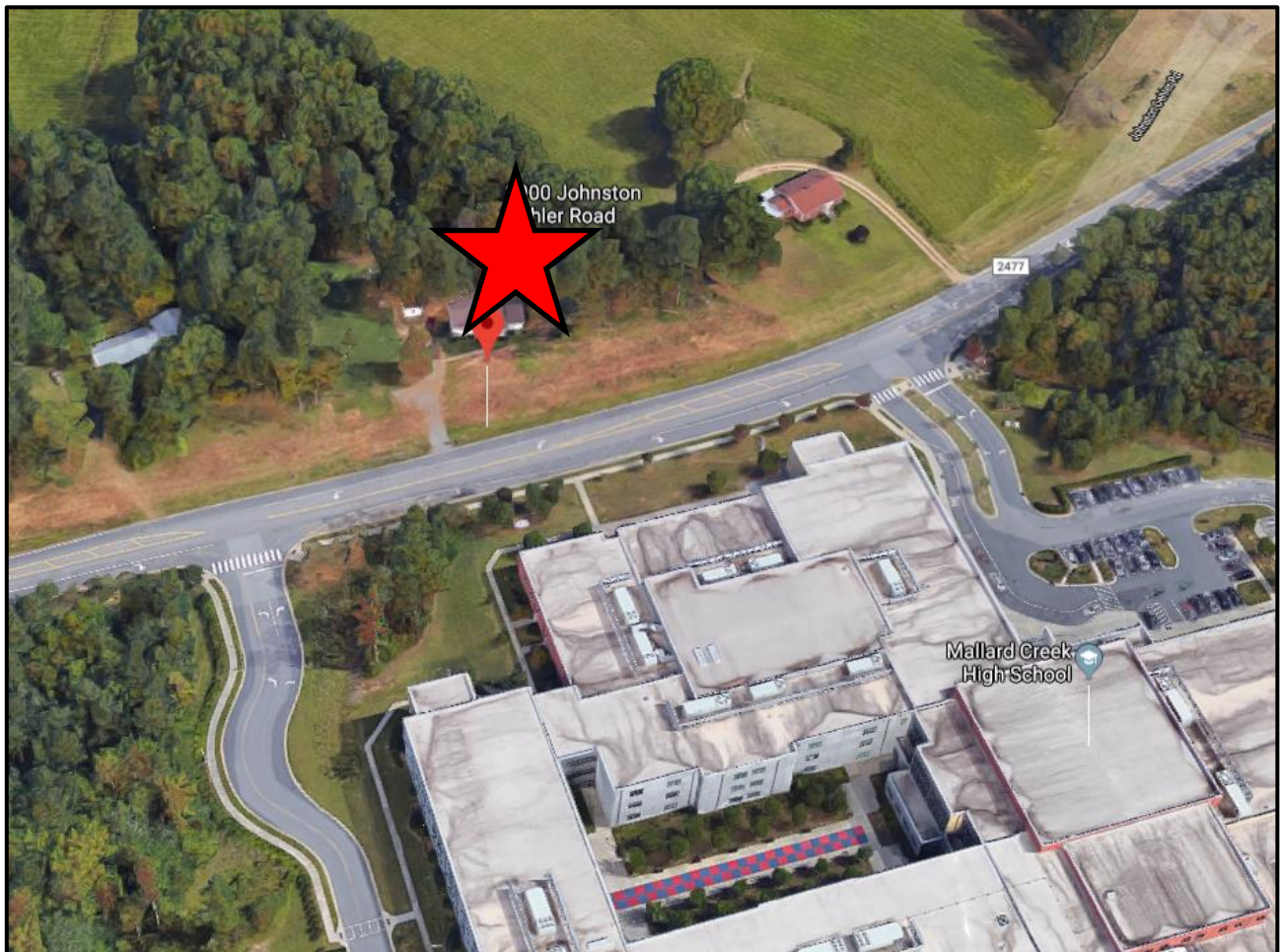
The subject property (denoted by red star) is developed with a single-family home.