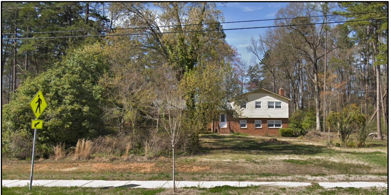
The property to the west along Johnston Oehler Road is developed with a single-family home.