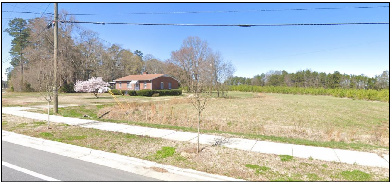
The property to the east along Johnston Oehler Road is developed with a single-family home.