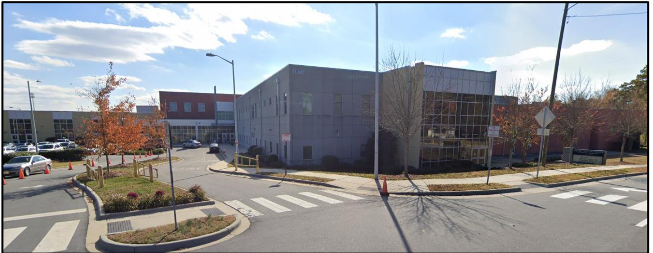
The property to the south along Johnston Oehler Road is Mallard Creek High School.