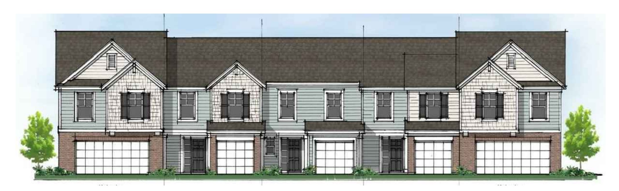
Images shown are conceptual in nature and intended to display design intent. Actual elevations are subject to change based on final design and approvals