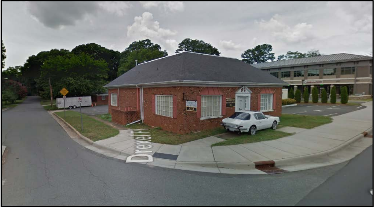
The site is developed with an office building and single-family residence.