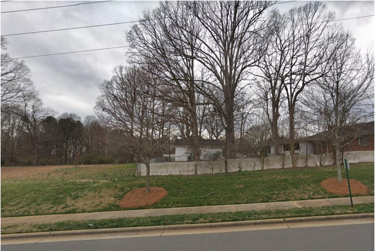
The property to the south is developed with a single family house.