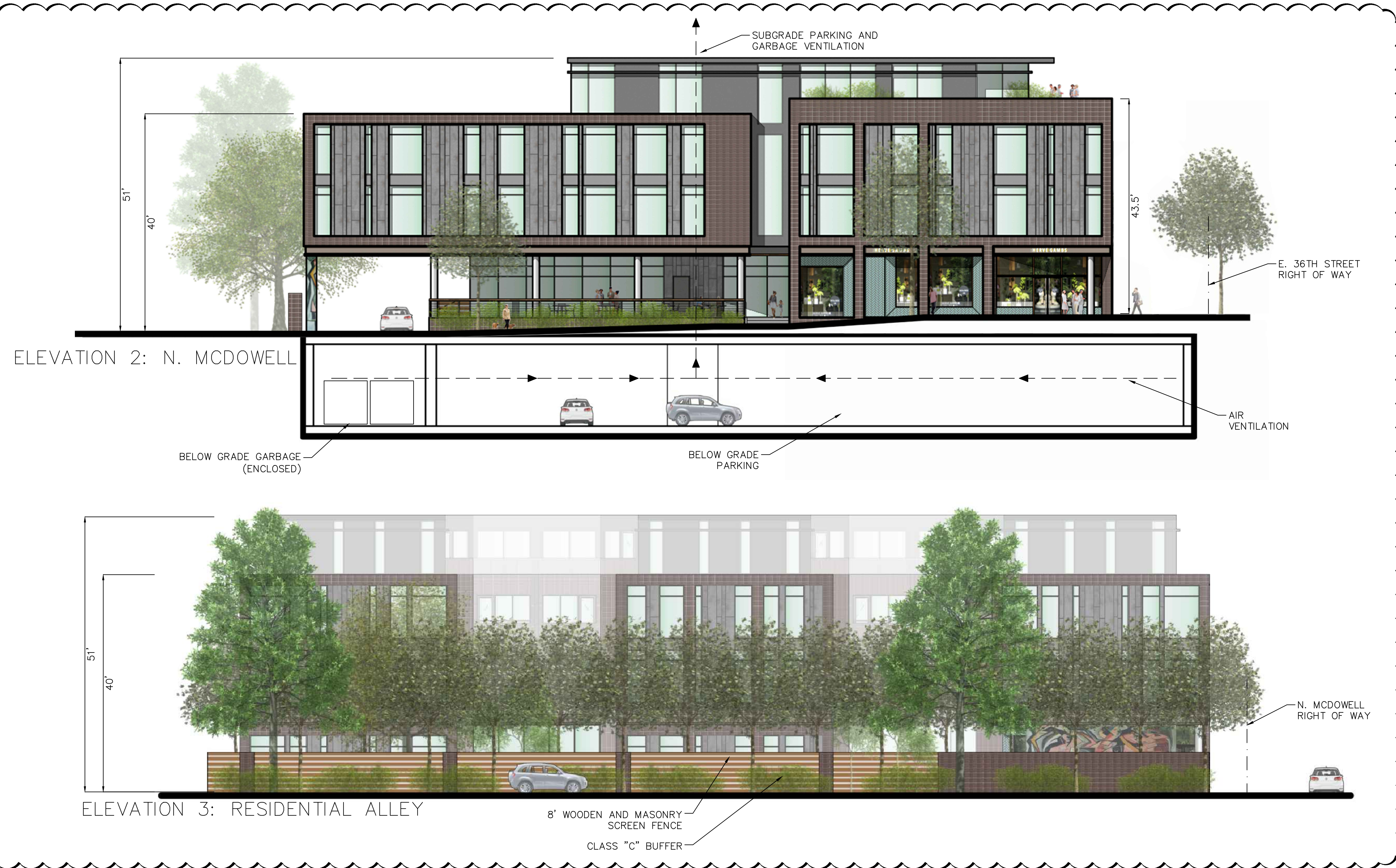
ELEVATION 3: RESIDENTIAL ALLEY

*ILLUSTRATIVE ARCHITECTURAL ELEVATIONS PROVIDED FOR REFERENCE PURPOSES ONLY. FINAL BUILT CONDITION MAY VARY FROM GRAPHIC ILLUSTRATIVE SHOWN. REFERENCE SHEETS RZ-1.0 FOR ASSOCIATED DEVELOPMENT CONDITIONS.