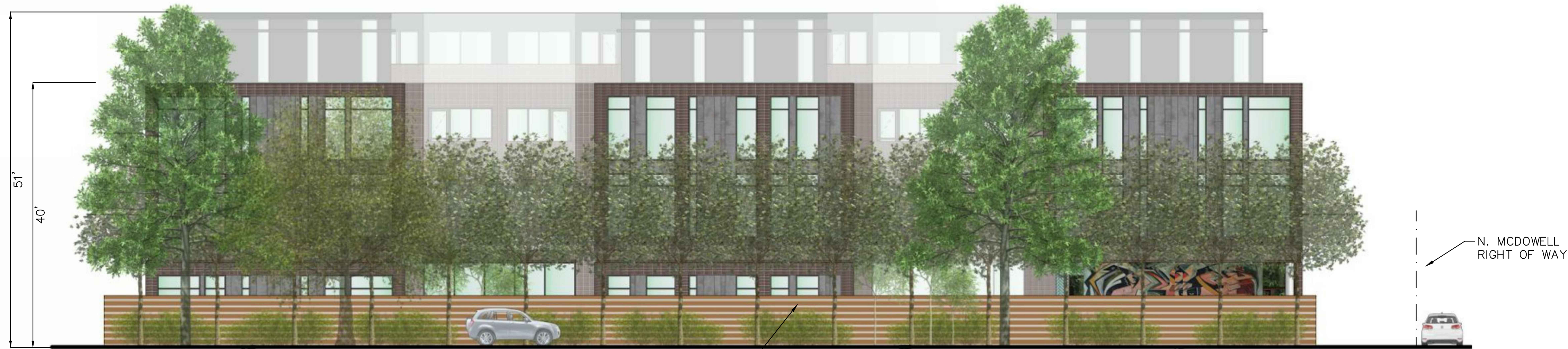
ELEVATION 3: RESIDENTIAL ALLEY