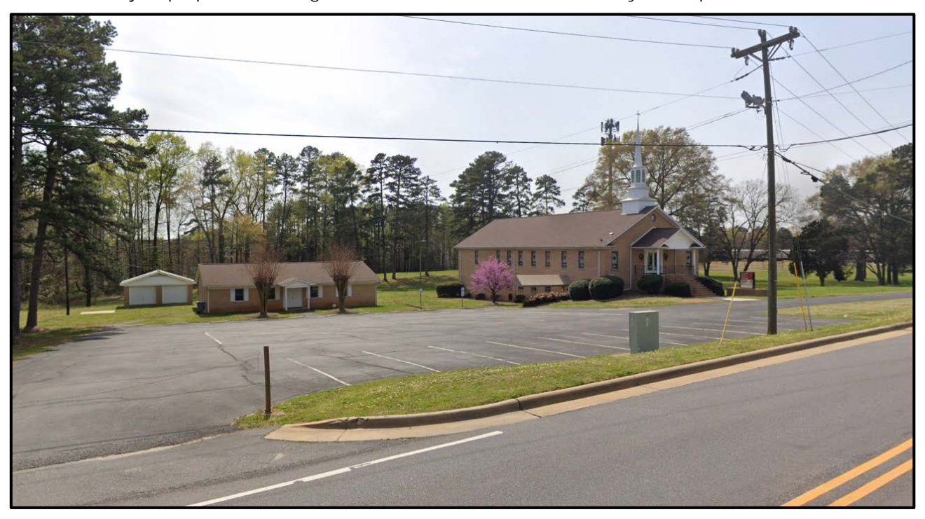
Institutional use on western side of McLean Road, just north of subject properties.