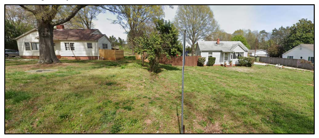
Looking northeast from McLean Road toward subject properties.