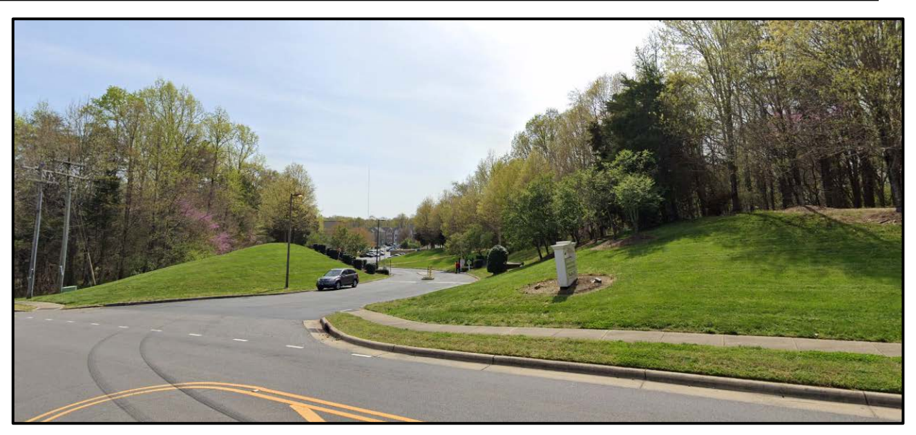
View from subject properties looking southwest. This site is a multi-family development.

Petition 2019-091 (Page 4 of 7) Pre-Hearing Staff Analysis