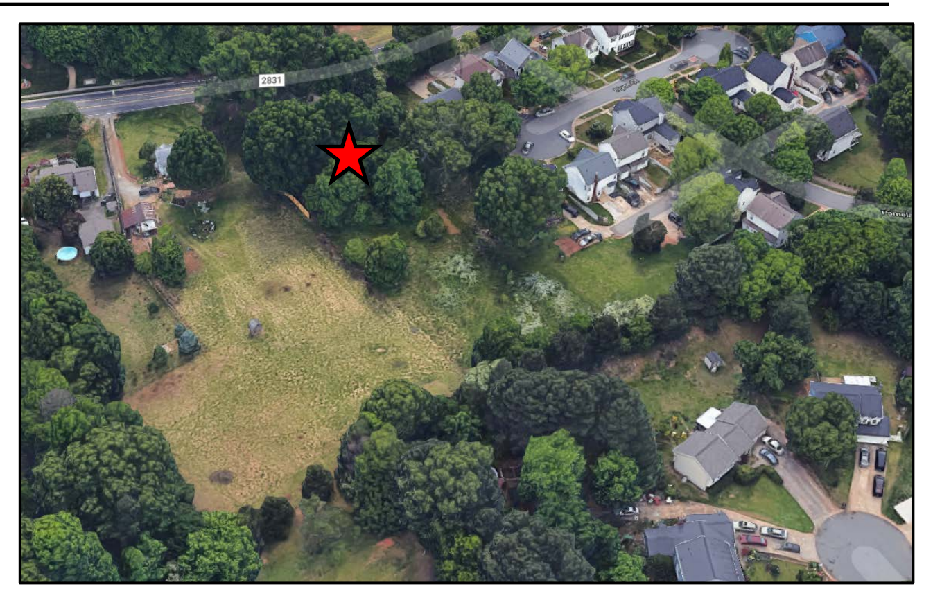
Subject properties (indicated by the red star) with surrounding single family residences in R-8 zoning to the north.