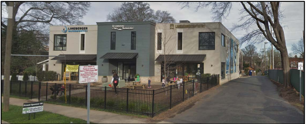
The property to the southwest along North Caswell Road is developed with medical offices and a preschool.