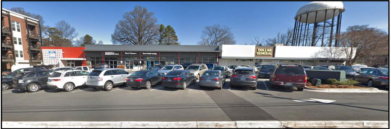
The properties to the northeast along East 7 th Street are a mix of retail and residential.