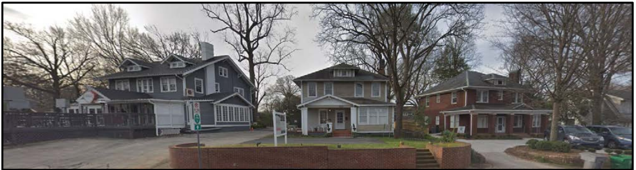
The properties to the south along North Caswell Road are developed with a mix of office, retail and an EDEE.