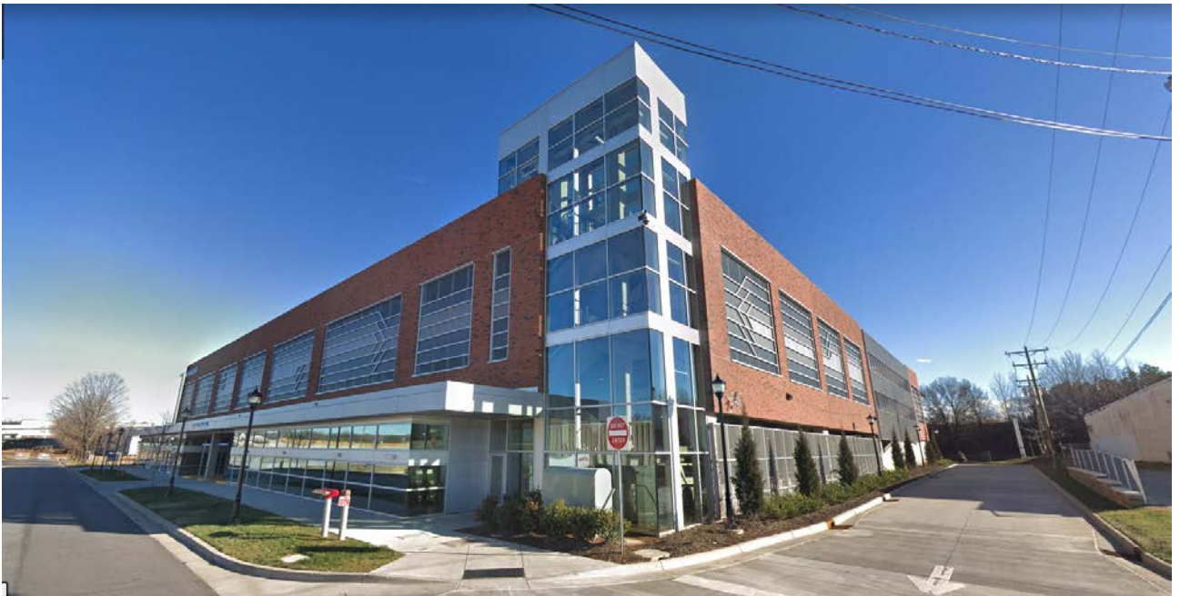
The property to the east is developed with a parking garage for the transit station.