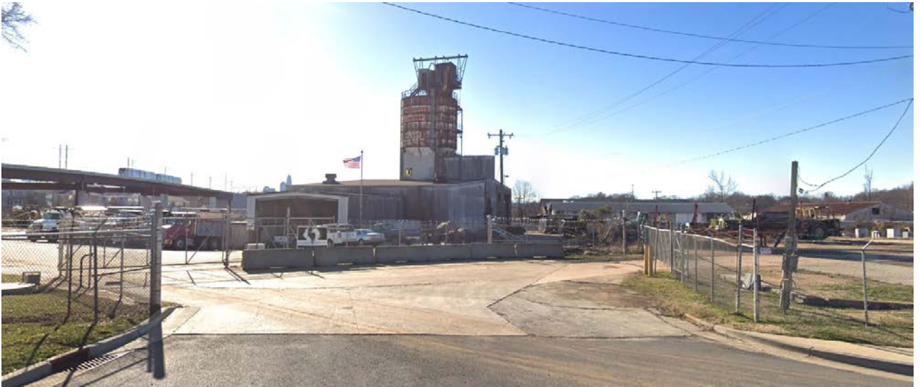
The property to the west is developed with industrial use.