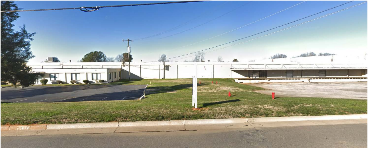
The property to the north is developed with industrial use.