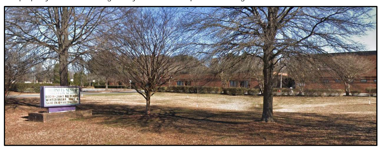
The property to the north along Beatties Ford Road is Hornet's Nest Elementary School.