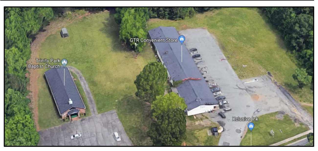
The property to the east along Trinity Road is developed with a religious institution and retail uses.