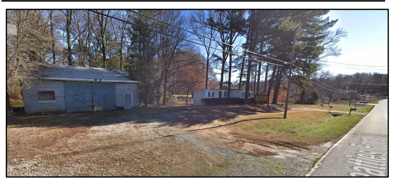
The subject property is developed with single family homes and a commercial use.