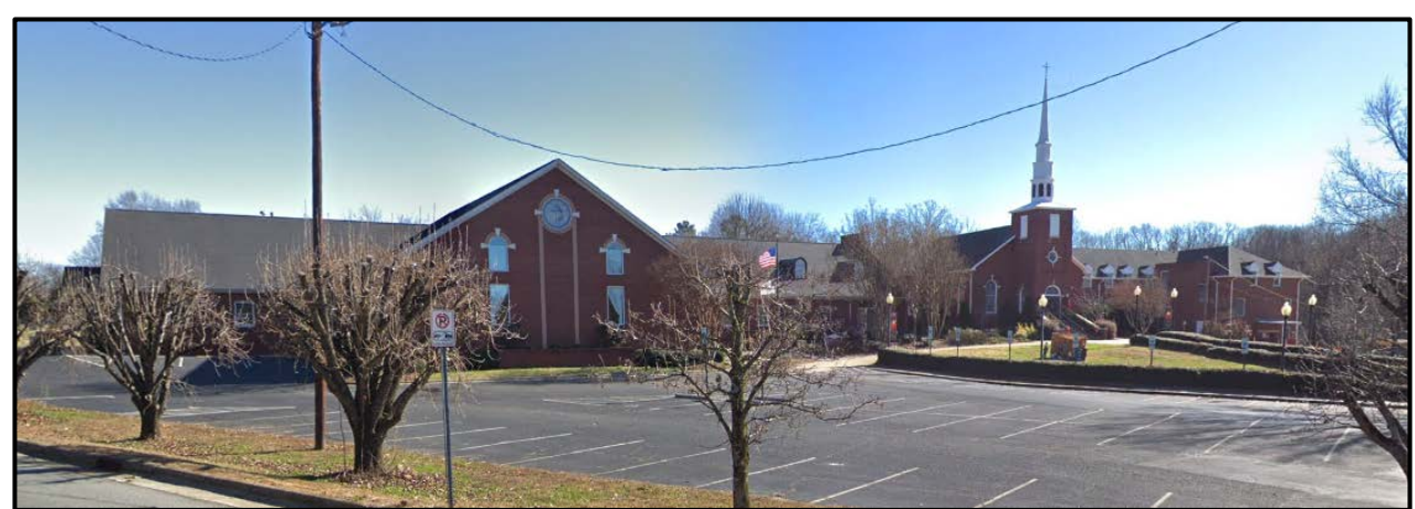
The property to the south along Trinity Road is developed with a religious institution.