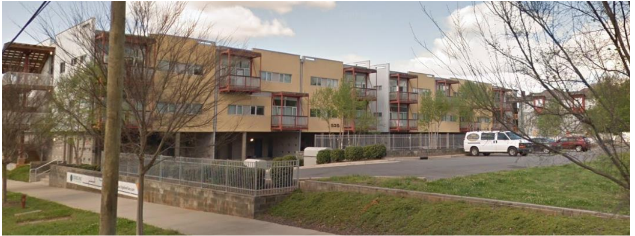
Multi-family dwellings are located nearby.