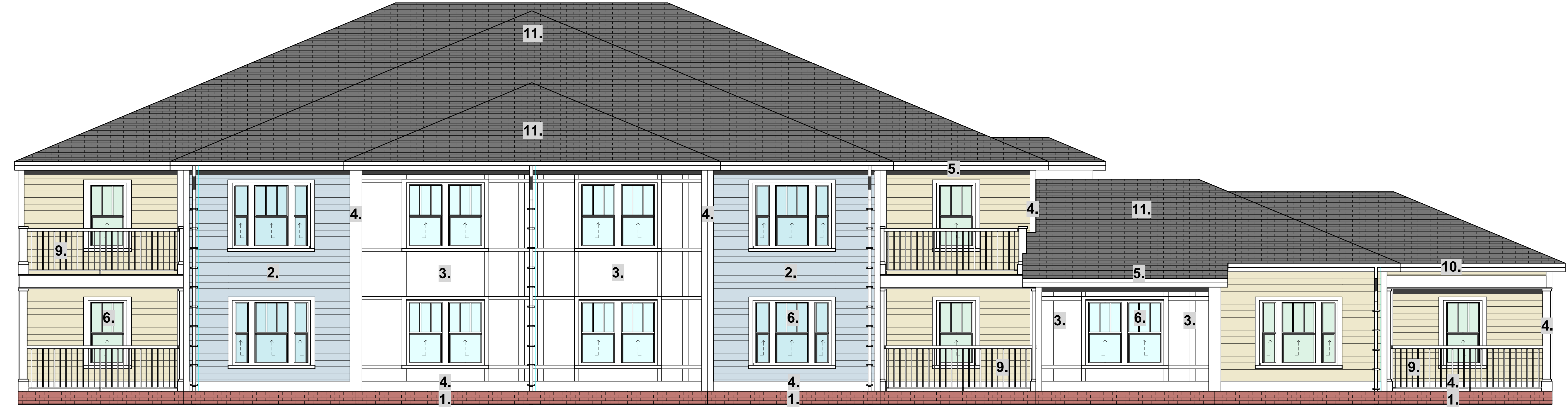
2 Multi-Family Building #6 Internal Parking Elevation Scale: 1/4" = 1'-0"

This Drawing is the property of Shook Kelley, Inc. and is not to be reproduced in whole or in part. It is to be used for the project and site specifically identified herein and is not to be used on any other project. This Drawing is to be returned upon the written request of Shook Kelley, Inc.