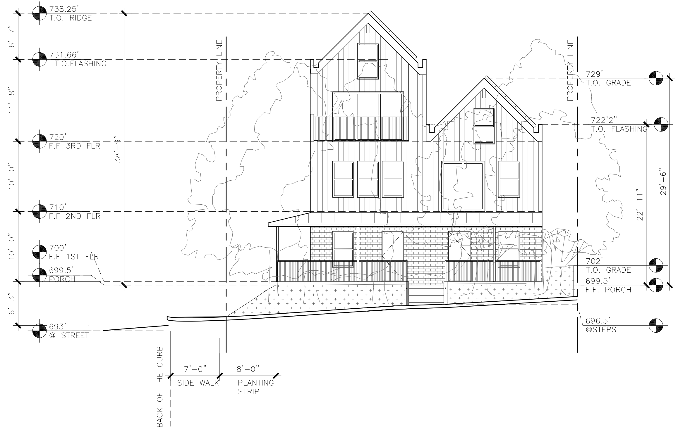
ELEVATION @ EAST 17TH STREET