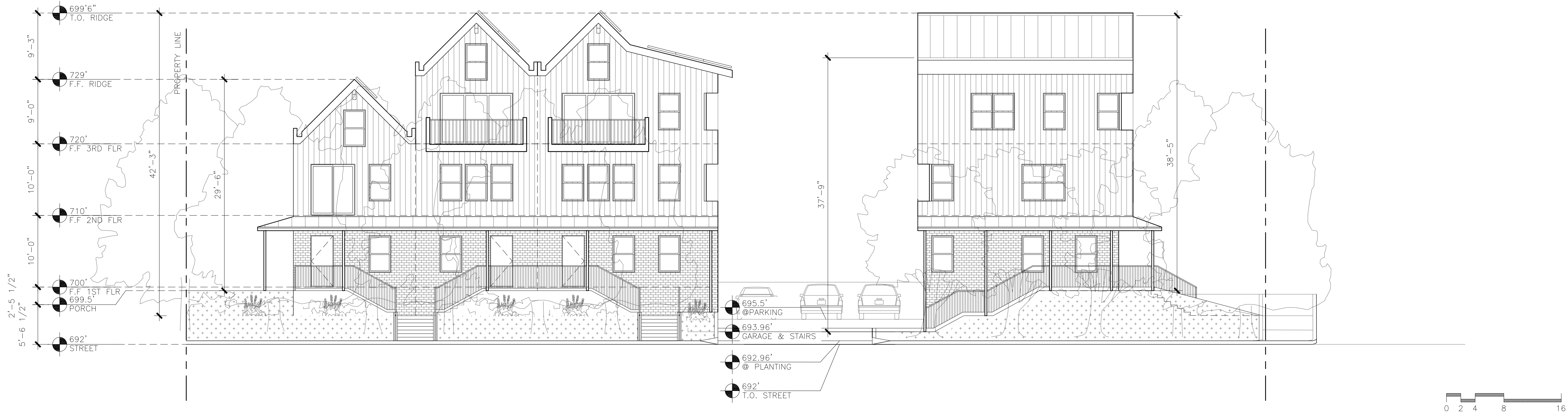
ELEVATION @ NORTH MCDOWELL STREET