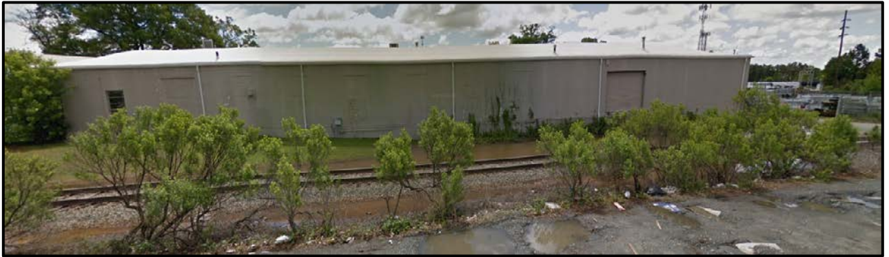
The property to the south along Lawton Road is a warehouse use.