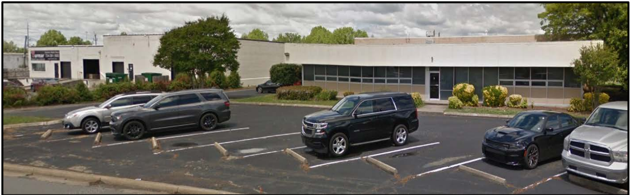
The property to the west along Lawton Road is an office/warehouse use.