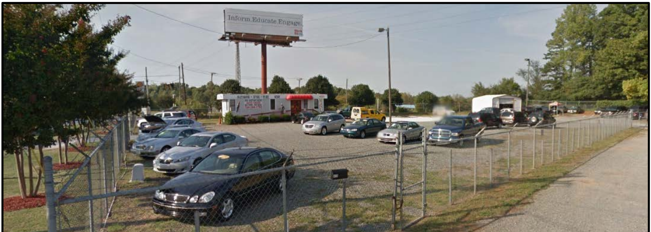
The property to the east along Brookshire Boulevard is an automobile sales use.