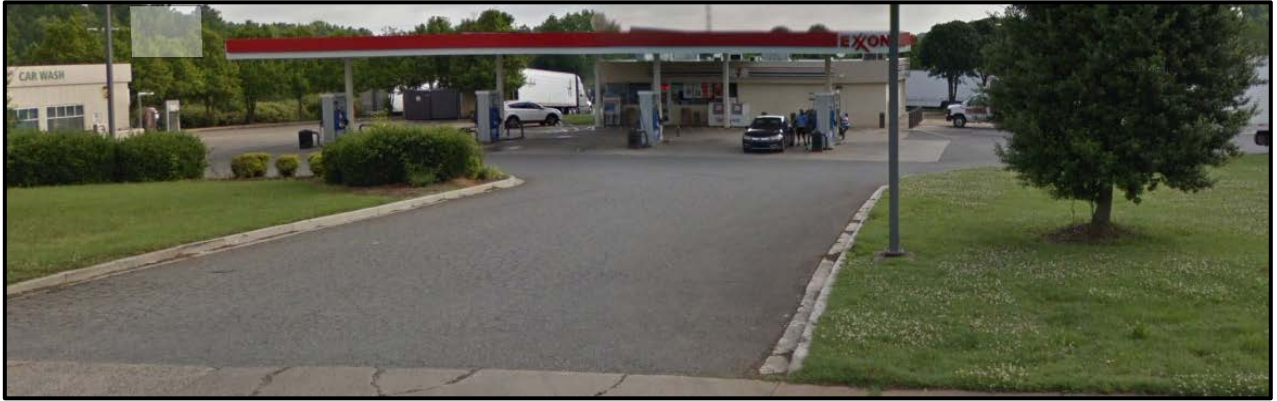
The property to the north across Brookshire Boulevard is a gas station.