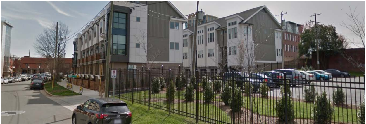
The property to the north is a mix of residential and office uses.