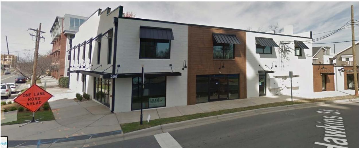
The property to the east is a mix of office, retail and residential.