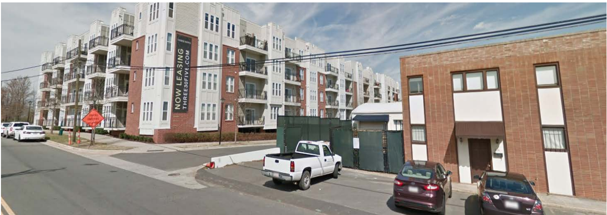
The property to the west is a mix of residential and office uses.