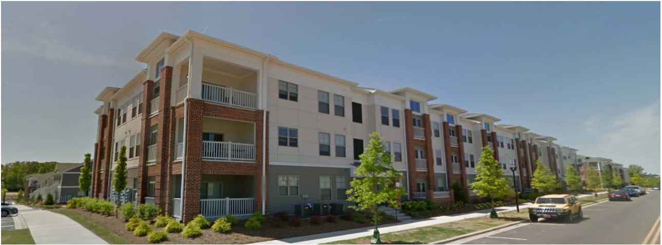
The City Park development is located to the west.