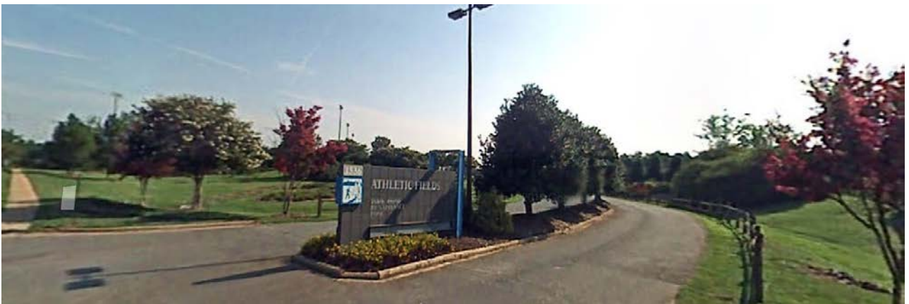
Renaissance Park is located to the south along West Tyvola Road.