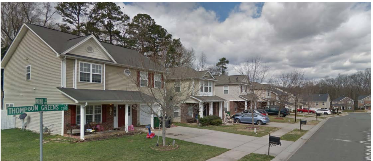
The property to the east is developed with single family homes.