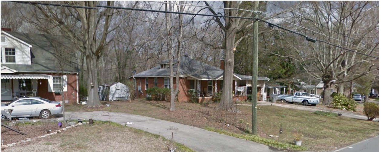
The subject property is developed with single family homes.