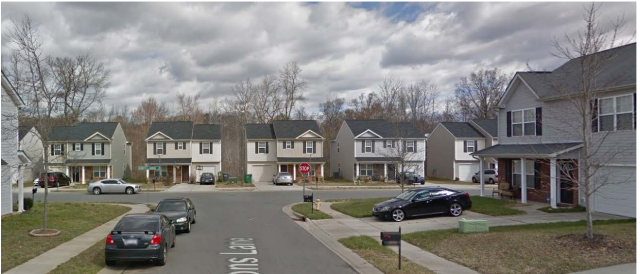
The property to the north is developed with single family homes.