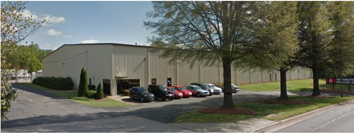
Properties to the west include industrial, distributive, and office uses and vacant land.