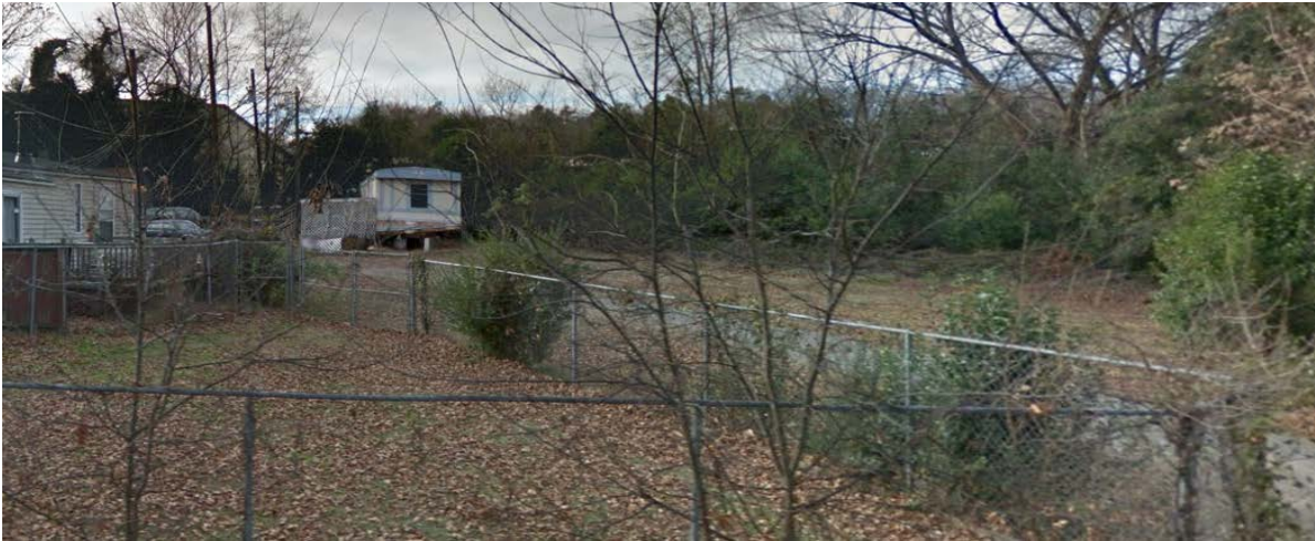
The subject property is developed with a manufactured home.