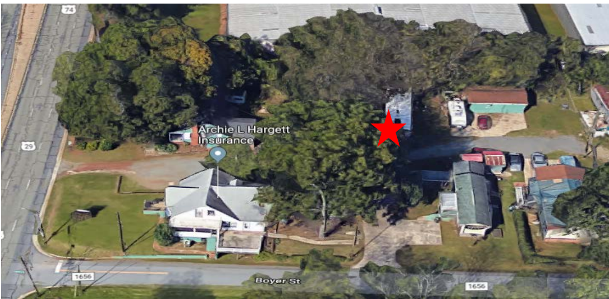
Properties to the south include office and residential uses. (The subject property is represented by the red star.)