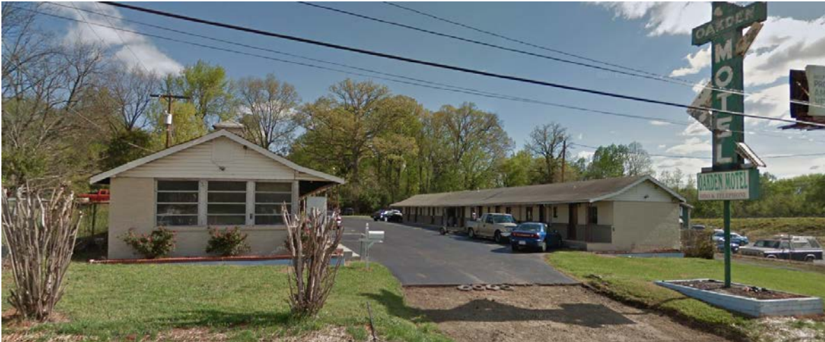
The property to the east is developed with a small motel.