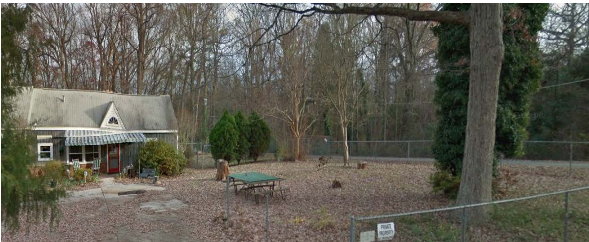
Properties to the north include vacant land rezoned in 2016 to I-2 (general industrial), additional vacant residential lots acquired by the City of Charlotte, and two remaining single family homes.