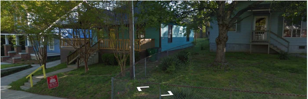
Surrounding properties are developed with single family homes.