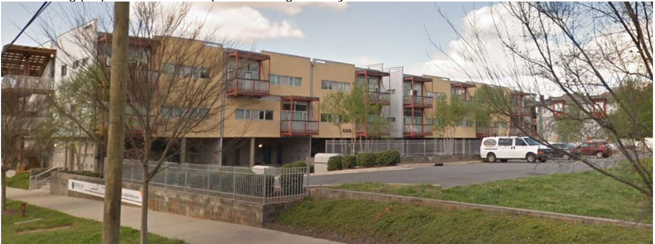
Multi-family dwellings are located nearby.