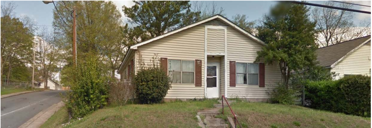
The subject property is zoned R-8 (single family residential) and developed with a single family house.