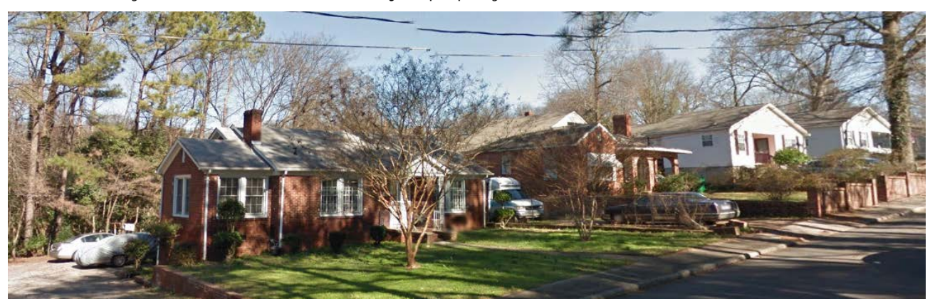
Properties to the south are single family homes.