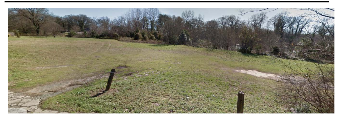
The subject property is vacant.

Petition 2018-057 (Page 3 of 7) Final Staff Analysis