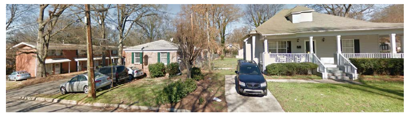
Properties to the north are developed with a mix of single family homes and multi-family apartments.