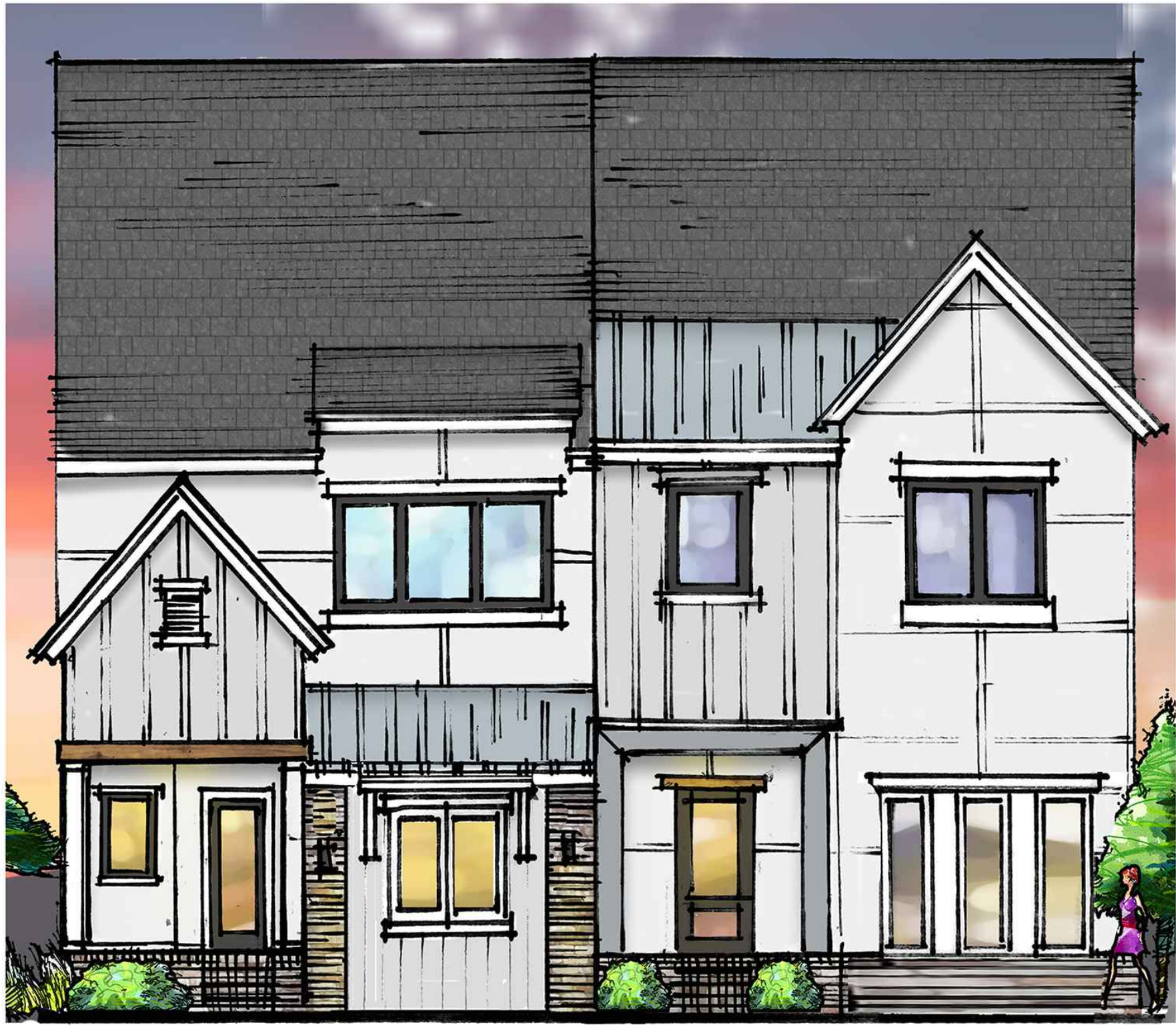
Building Elevations (typ.)