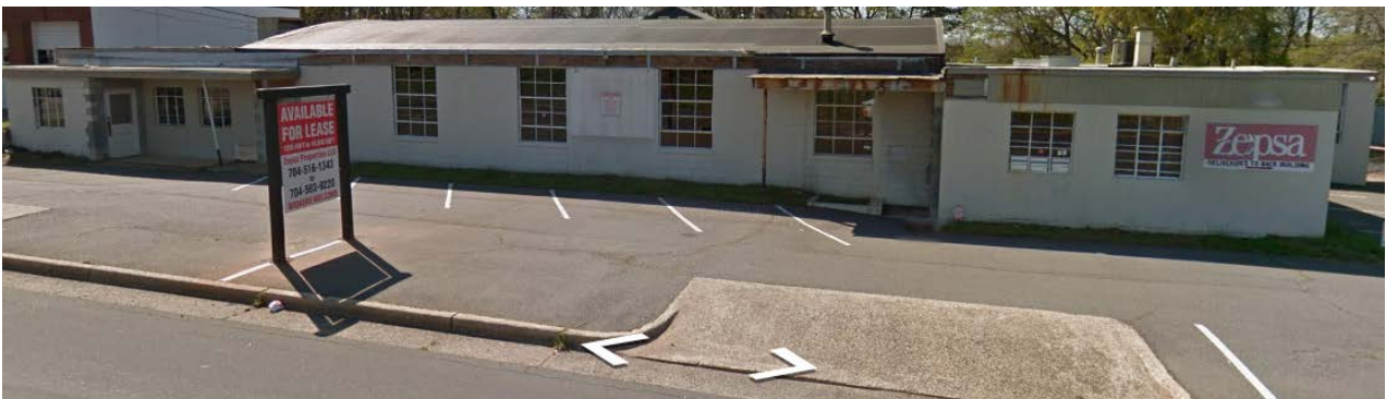
The subject property is developed as a warehouse.