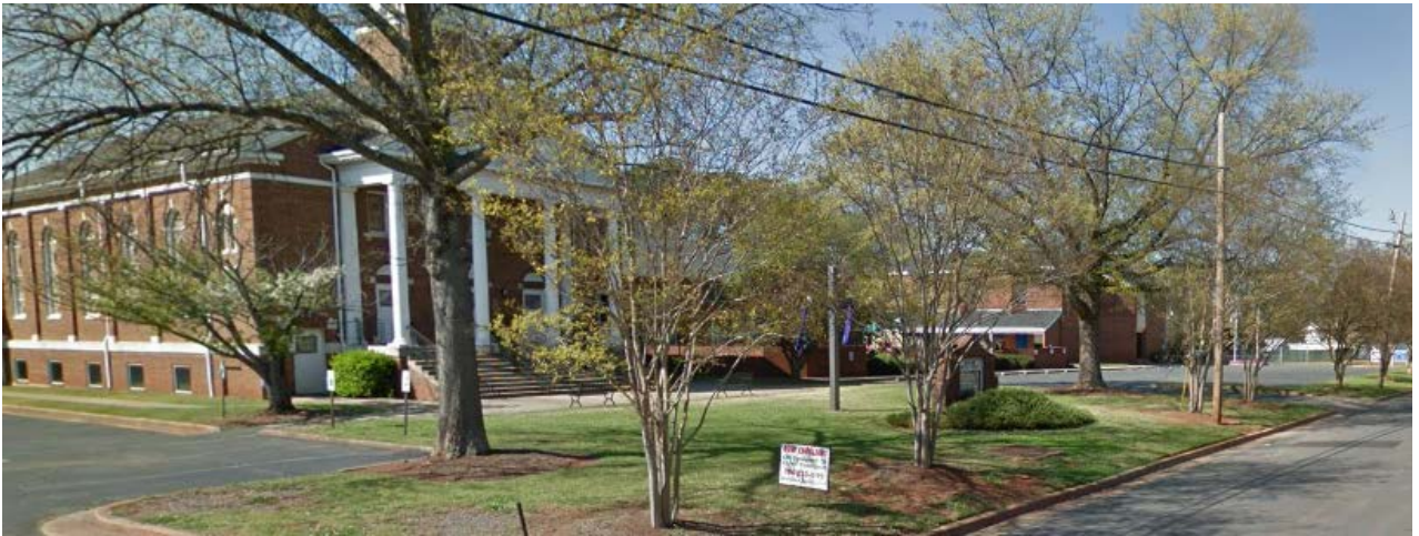
Woodlawn Baptist Church is located to the south of the property.