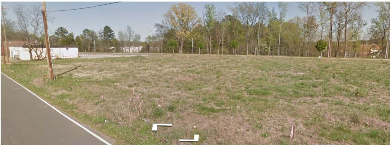
The property across the street is zoned I-2 (general industrial) and vacant.