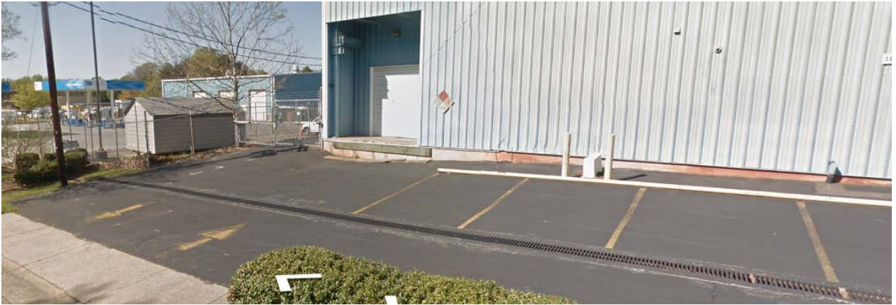
The surrounding properties are developed with industrial uses.