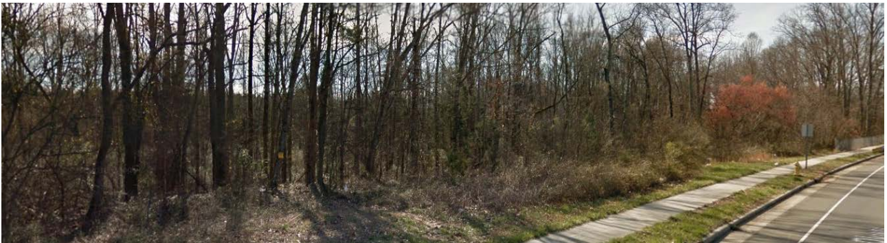
Properties to the east are undeveloped.