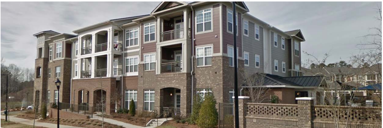
Properties to the south are developed with multi-family apartments