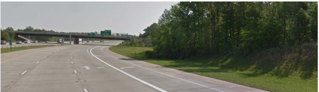
The property is bordered by Interstate 485 to the west.