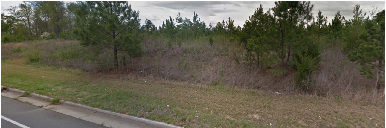
The subject property is undeveloped.